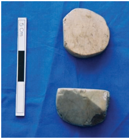
Figure 10 Marble polishing tool probably used for smoothing of plaster walls and floors

palettes, Fig. 11). The role of such tools in creation of wall paintings is a central focus, in conjunction with the work of Duygu Çamurcuoğlu Cleere (see above) on the technology of the wall paintings.