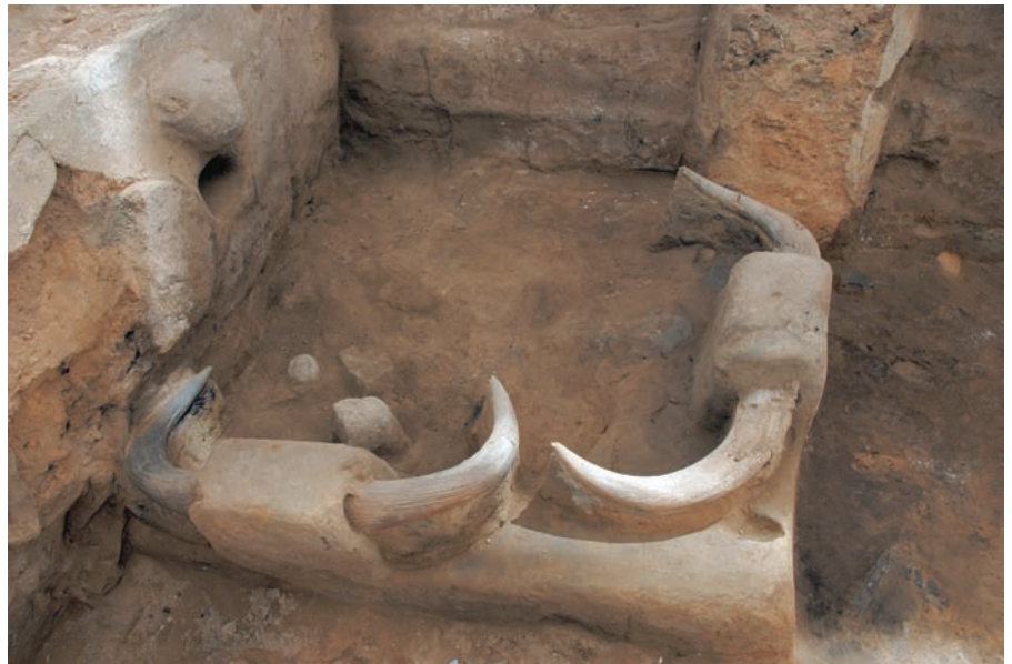
Figure 4 Cattle horncores set in plaster in the burnt Building 77, 4040 Area