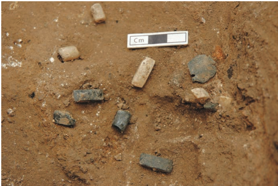
Figure 9 The same burial as shown in Fig. 8, showing stone beads uncovered underneath the skull

appears to be wide variation in access to, or use of, raw materials (e.g. marble, apatitic limestone and carnelian) from one household to another. With its well defined architectural units, Çatalhöyük lends itself to a suite of questions reliant on contextual analyses at the household level. The team is currently researching variations from house to house, with a particular emphasis on identifying techniques and areas of production. The bead-making process, including the acquisition of raw materials and the manufacture of the objects, is being closely examined. In 2007, the excavation of a possible red limestone bead workshop in Building 75 (South Area) provided the first major evidence of an in situ stone bead manufacturing area at Çatalhöyük, while other houses so far have revealed comparatively little evidence for manufacturing.