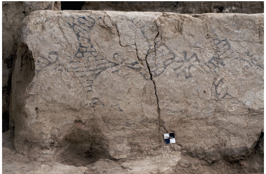
Figure 5 Painting around the edge of a burial platform in Building 49 in the 4040 Area