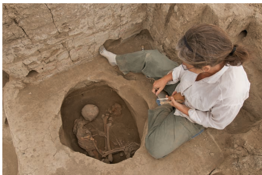
Figure 7 Excavation of a burial in a typical Çatalhöyük platform beneath a house floor

The UCL group has focused in recent years on ensuring that there is a full database inventory for all excavated skeletons (1020 maximum but this includes isolated bones) to enable future analyses.