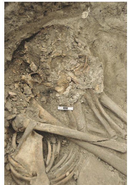
Figure 8 Burial of a juvenile, c.12 years of age with white marble disc beads near the neck area