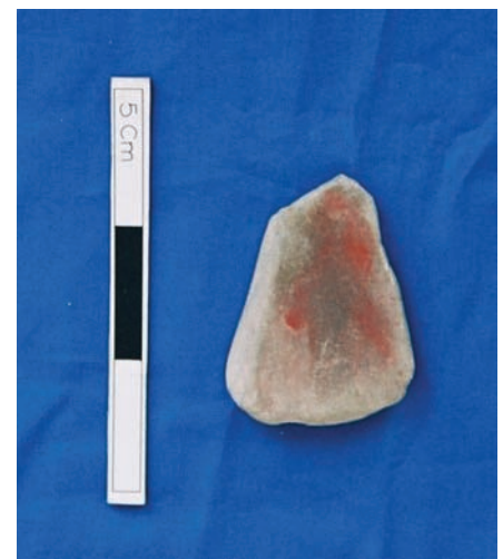
Figure 11 Schist palette with paint residue

British Institute of Archaeology at Ankara Monograph, 2005). A further publication is: I. Hodder, I, 2006 Çatalhöyük: the Leopard's Tale, revealing the mysteries of Turkey's ancient "town" (London: Thames and Hudson, 2006).