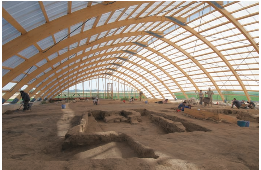
Figure 1 The new shelter constructed in 2008 over the North area of Çatalhöyük (including the 4040 Area); the shelter was designed by Atölye Mimarlık in Istanbul and serves to protect the archaeological remains and to become a display area for the public

individual buildings to understand their construction, occupation and closure. The current phase of the project (2003–08) aims to explore the social geography of the settlement and larger community structure, asking questions such as how were production, social relations and art organized beyond the domestic unit? How did organization develop over time? Does the social geography of the site involve groups of houses clustered around dominant houses, or is all social and economic life decentralized and based on equivalent domestic units of production? In order to address these questions, the project has moved beyond the detailed analysis of individual buildings, and is now focusing on analysis of large