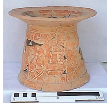
Figure 6 David Pendergast termed this form a “chalice” due to its high pedestal base. These large, elaborate vessels are characteristic of the Postclassic period at Lamanai and were frequently smashed over burials.

Goods, people and ideas moved through Lamanai in the Postclassic and the community’s richly decorated ceramics show this. Politically and economically, Lamanai was probably the capital of the region or province of Dzuluinicob in the