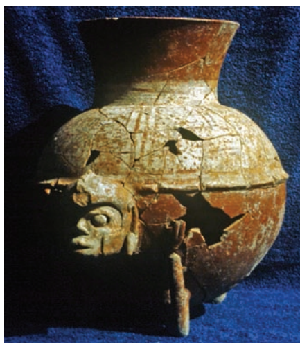
Figure 5 This vessel representing a monkey was found in the same tomb as the hunchback vessel.

Furthermore, it appears that most Lamanai ceramics were produced near the site, although they often resemble exotic styles. Given that most vessels were made locally, that paste and surface finish do not consistently co-vary, and that ware has been applied differently across the Maya area, I find ware more of a liability than an asset. Still, I need a way to group stylistically similar pots because this can provide clues about interaction in the Postclassic. In grappling with this problem I noticed that type-variety as originally developed in the 1950s includes two taxonomic levels designed for inter-site and inter-regional comparison: ceramic system and ceramic sphere. Oddly, the first of these has never been used in Belize.