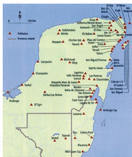
Figure 2 Postclassic period sites in the Maya area are concentrated in the northern lowlands of Belize and Mexico.

There are hundreds of abandoned cities across the Maya region of Mexico, Belize, Guatemala, and Honduras. Many of the most spectacular ones, such as Calakmul on the dry Yucatan peninsula of Mexico, Tikal in the Peten rainforest of Guatemala, and Caracol in the Maya Mountains of Belize, were indeed abandoned rapidly in the last century of the Classic period (AD 250–900). However, beginning with the Carnegie Institution of Washington's work at the