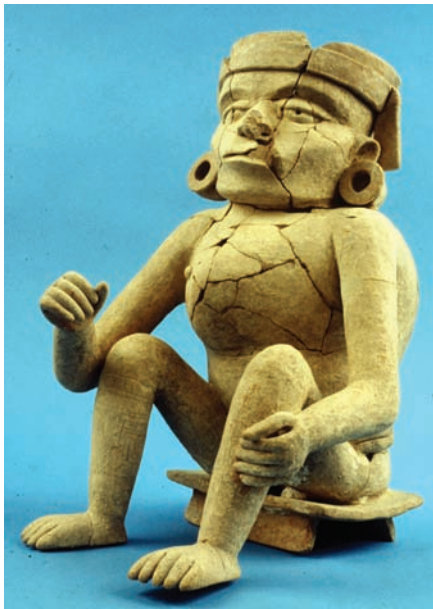
Figure 4 David Pendergast excavated this spectacular vessel depicting a hunchbacked man from one of latest elite tombs at Lamanai, probably dating from the late 15th to early 16th century.

Furthermore, it appears that most Lamanai ceramics were produced near the site, although they often resemble exotic styles. Given that most vessels were made locally, that paste and surface finish do not consistently co-vary, and that ware has been applied differently across the Maya area, I find ware more of a liability than an asset. Still, I need a way to group stylistically similar pots because this can provide clues about interaction in the Postclassic. In grappling with this problem I noticed that type-variety as originally developed in the 1950s includes two taxonomic levels designed for inter-site and inter-regional comparison: ceramic system and ceramic sphere. Oddly, the first of these has never been used in Belize.