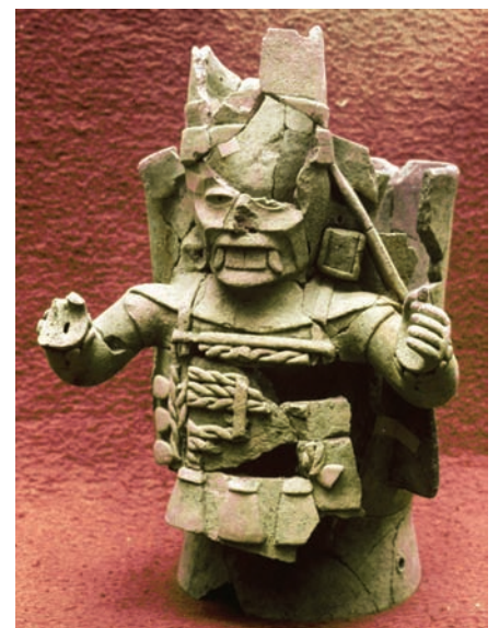
Figure 7 Censers like this one depict human figures in cotton armour. They closely resemble examples from Mayapan, Mexico, but are executed in a distinctly Lamanai style.