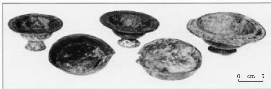
Figure 3 Five pewter vessels excavated from context 6640 at Elms Farm.

In general it is advisable to involve an archaeological conservator in the assessment of an entire assemblage of finds, so that the retrieval of information from them can be maximized. Just as importantly, certain objects that appear robust may require treatment and it is not always possible to determine their chemical stability by eye. The conservator is able to advise on this and may also be well placed to assist with other aspects of post-excavation work.