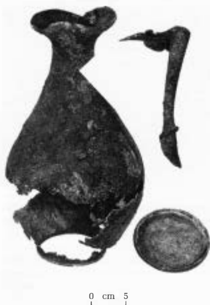
Figure 4 The late second-century AD copper-alloy flagon excavated from context 15368 at Elms Farm. The body of main vessel is on the left, flanked on the upper right by the handle, made in the form of a leg, and on the lower right by the base.

appears to date to the late second century AD. It was excavated from context 15368, which was described as a “distinctive . . . pit of ritual significance, [a] small shallow feature [that] contained no other finds”. 15 Similar flagons have been found in association with rich burials in Essex, for example at Stansted. 16