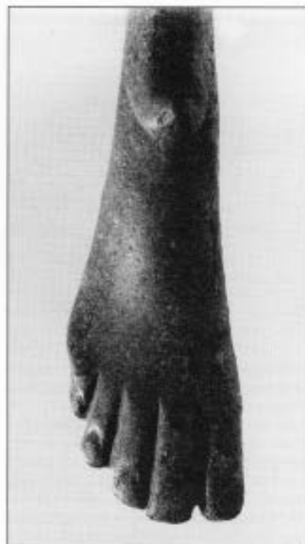
Figure 5 The foot that forms the lower end of the flagon handle, after conservation treatment.