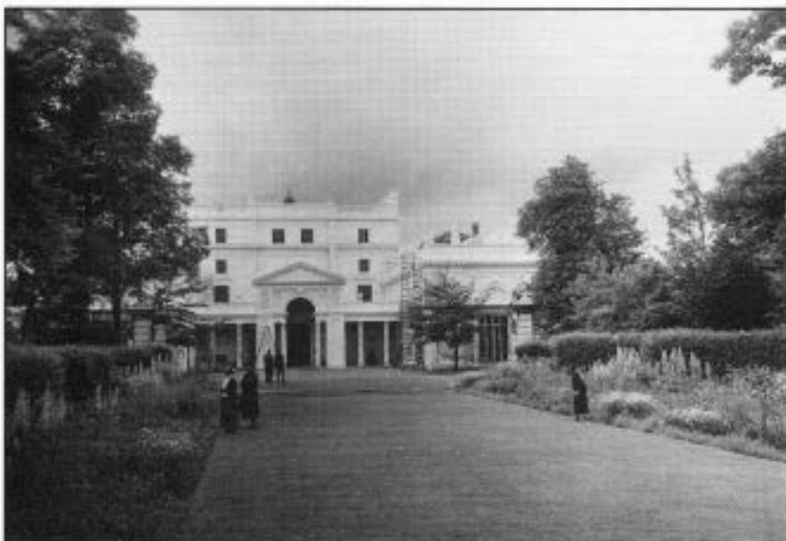
Figure 1 The first home of the Institute of Archaeology: St John's Lodge, Regent's Park, in 1937.

By far the most significant development at this time was, however, the incorporation of the Institute into University College