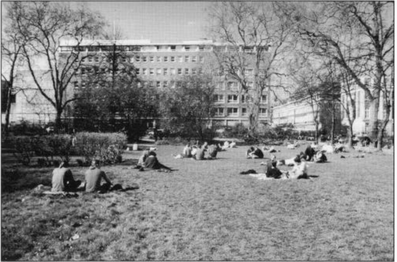
Figure 2 The building occupied by the Institute of Archaeology today, seen from Gordon Square.

London (UCL), its nearest academic neighbour and the largest multifaculty school of the University. This took place in 1986, while Sir James Lighthill was Provost of UCL, and was preceded by complex negotiations on the academic, financial and administrative implications of the “merger” – a rather mechanistic term for what was in reality the long-delayed realization of part of Mortimer Wheeler’s original vision for his Institute. 7 During the protracted discussions that followed Wheeler’s original approach to the University in 1927, University College had appointed him to a part-time Lectureship in Prehistoric Archaeology and had agreed to transfer its Egyptology and Classical Archaeology Collections to the proposed new Institute of Archaeology. In 1934 the College even offered space for the Institute at a nominal rent in a former stable it had acquired in Foster Court (where the Petrie Museum of Egyptian Archaeology is now housed); an offer that was, however, soon eclipsed by the more alluring prospect of much more spacious accommodation in St John’s Lodge. So, the Egyptology and Classical Archaeology collections remained at UCL (where chairs in both subjects had been established in the late nineteenth century) and