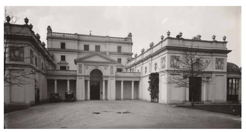
The Institute of Archaeology's original home at St John's Lodge, Regent's Park, from 1937-57.