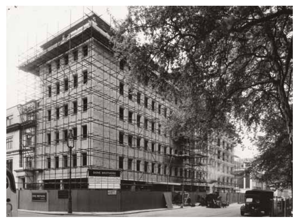
The current Institute of Archaeology building nearing completion in early 1957.