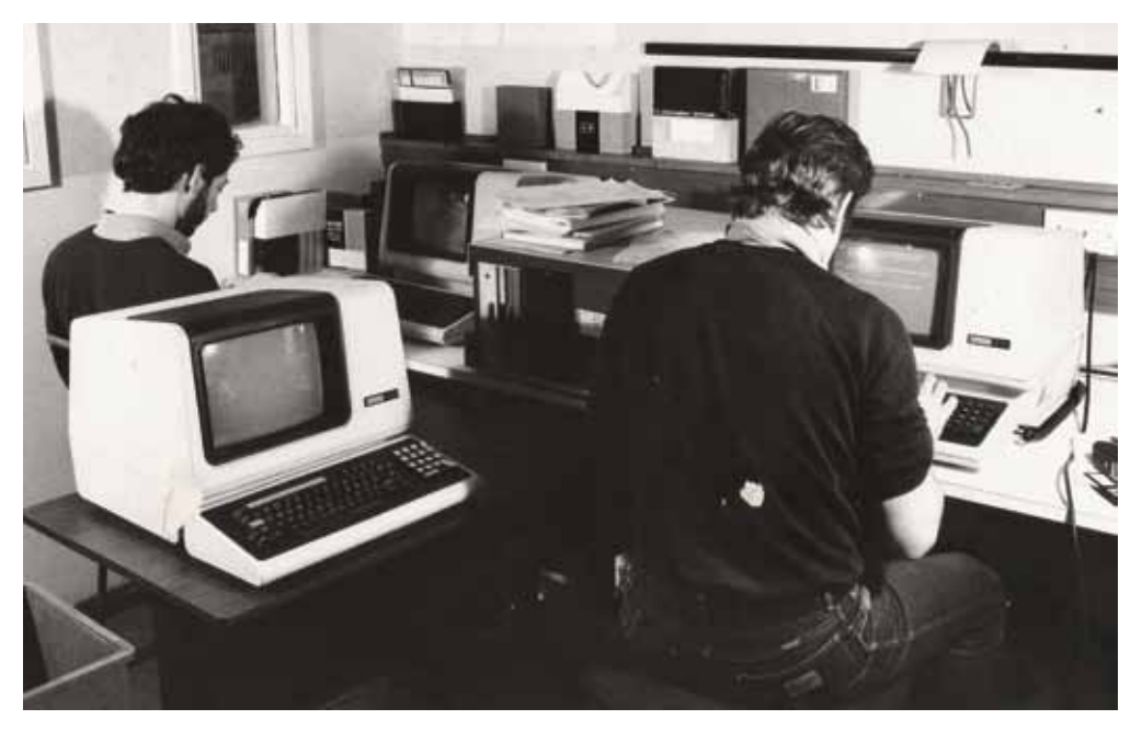
Students using the Institute's first computer network: 'dumb' terminals linked to a mini-computer in the adjacent room (c.1985).