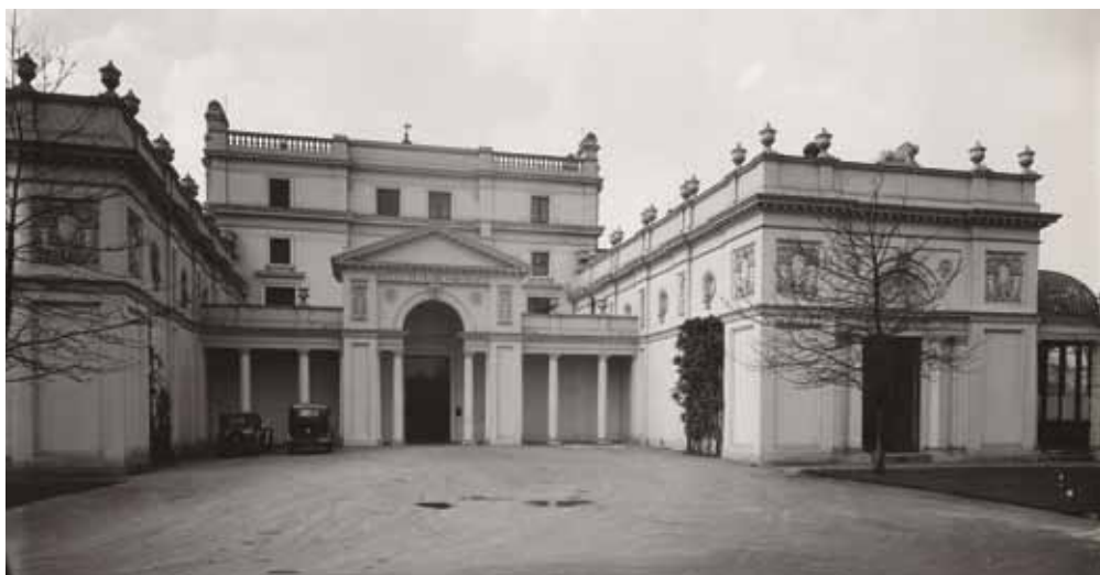
The Institute of Archaeology's original home at St John's Lodge, Regent's Park, from 1937-57.