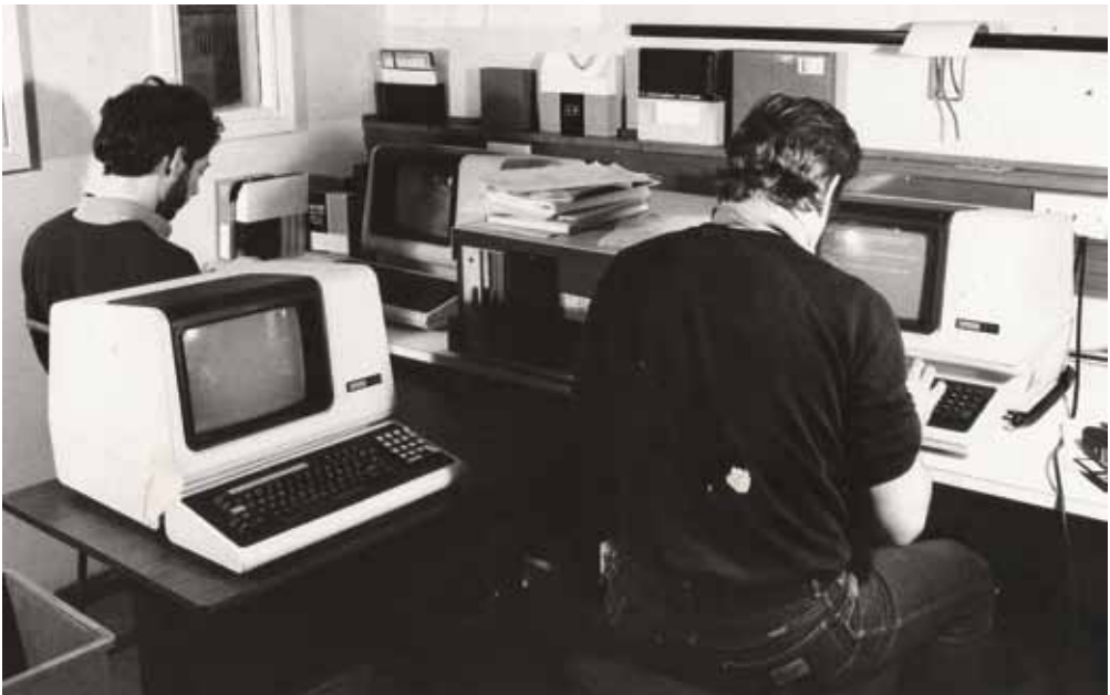
Students using the Institute's first computer network: 'dumb' terminals linked to a mini-computer in the adjacent room (c.1985).