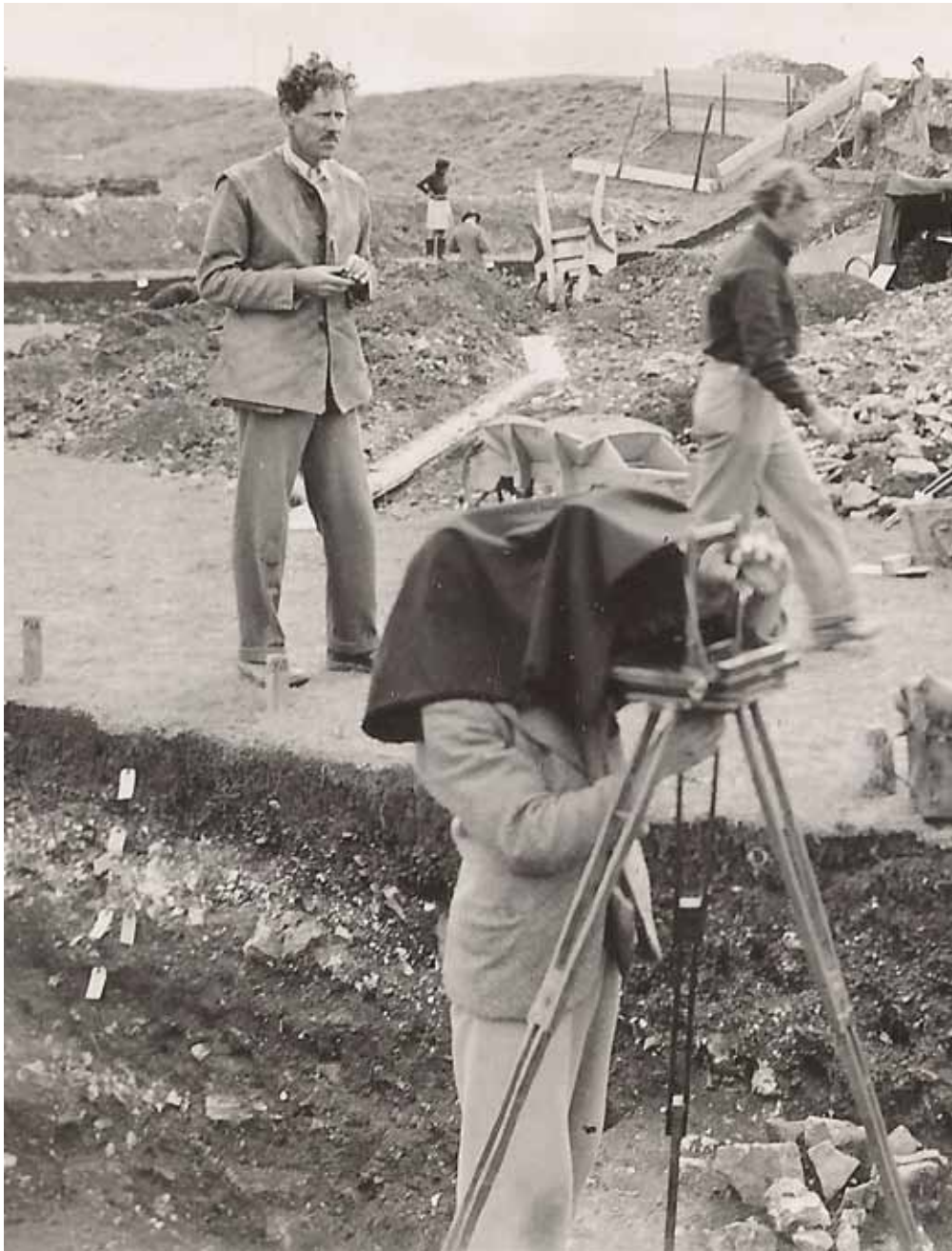
Sir Mortimer Wheeler, Director of the Institute from 1937 to 1944.