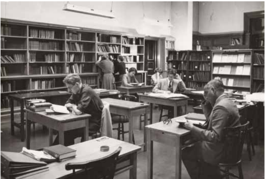
The Library at St John's Lodge.