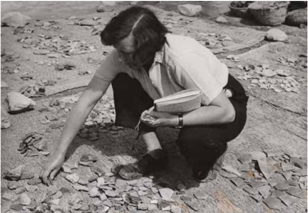
Kathleen Kenyon working on material from Jericho, where she excavated from 1952-58.