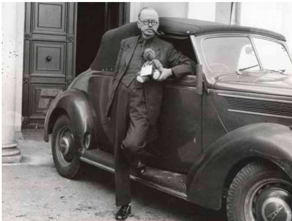
Gordon Childe, Director of the Institute from 1946-57, with a teddy bear given to him by students at Brno University.