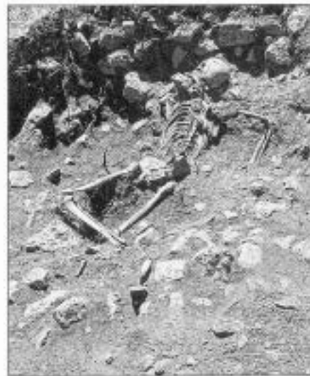
Figure 2 The skeleton of a Second World War machine gunner exposed during archaeological excavation on Bezymyanaya hill.

property (for ecumenical use, after official permission, by all Orthodox factions) and to reinforce the authority of the National Preserve. However, presidential haste to get the restoration completed led to the unexpected arrival of bulldozers during the summer, which proceeded to tear a 2×3 m trench for pipes and cables right through the unexcavated heart of the Greek city.