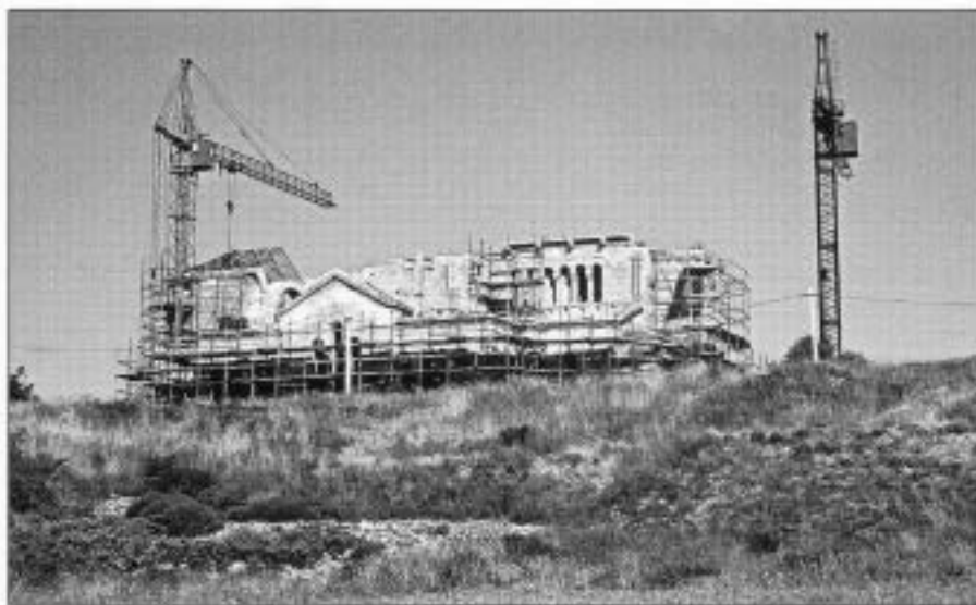
Figure 3 The ruined nineteenth-century cathedral of St Vlodymyr on the acropolis of Chersonesus under reconstruction, June 2000.