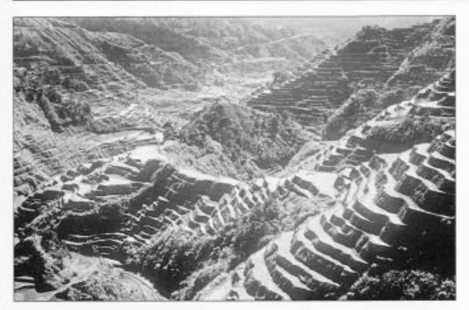
Figure 1 Wet-padi (rice) terraces of the Ifugao at Baraue, Luzon, Philippines.

ensembles of various kinds, 18 per cent are historic towns, and 12 per cent archaeological sites, whereas only 7 per cent are cultural landscapes, 5 per cent are industrial properties, and 1 per cent are heritage of the late nineteenth and twentieth centuries.