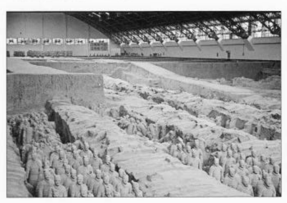
Figure 9 The Museum of the Emperor Qin Shihuang's Terracotta Army, Xi'an, China.