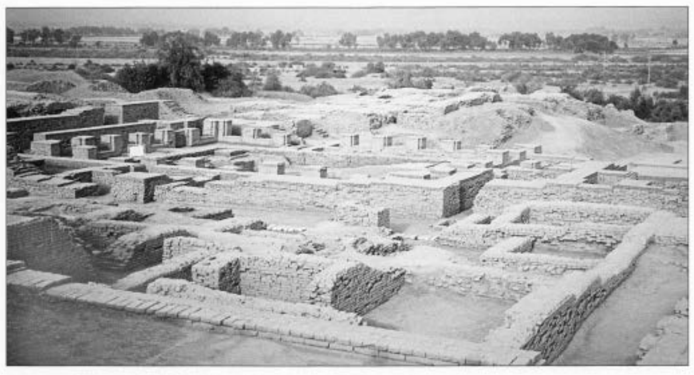
Figure 2 General view of Mohenjo-daro, a site of the Indus Valley civilization, Pakistan.

The ancient riverine civilizations are represented by most of the best known sites in Egypt, but the Indus valley civilization is represented only by Mohenjodaro (Fig. 2), and ancient Mesopotamia only by Ashur and Hatra. The early archaeological sites of sub-Saharan Africa, apart from those with exceptional rock art or related to fossil hominids, have so far been ignored, with the exception of the