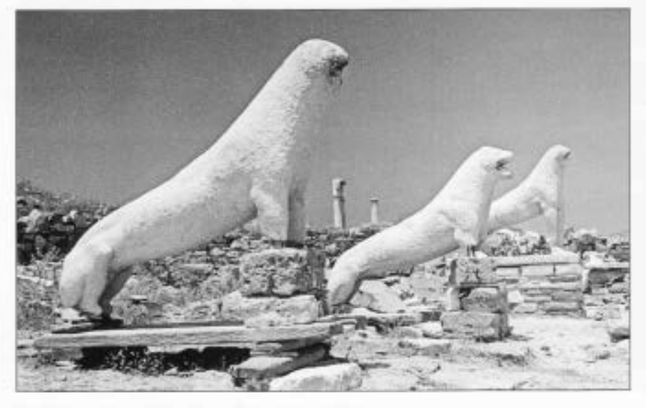
Figure 5 The Portico of the Lions, Delos, Greece.

Among the sites representative of the Andean civilizations are Machu Picchu