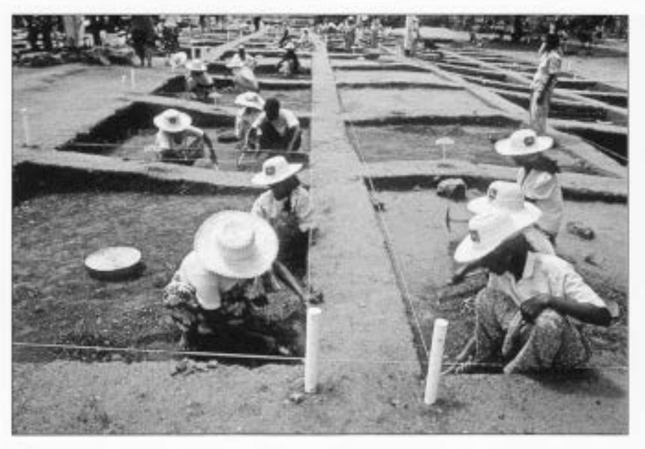
Figure 8 Excavation on progress at the site of a monastery at Anuradhapura, Sri Lanka.

overcoming national aspirations and prejudices to make the List truly representative of millennia of human achievement.