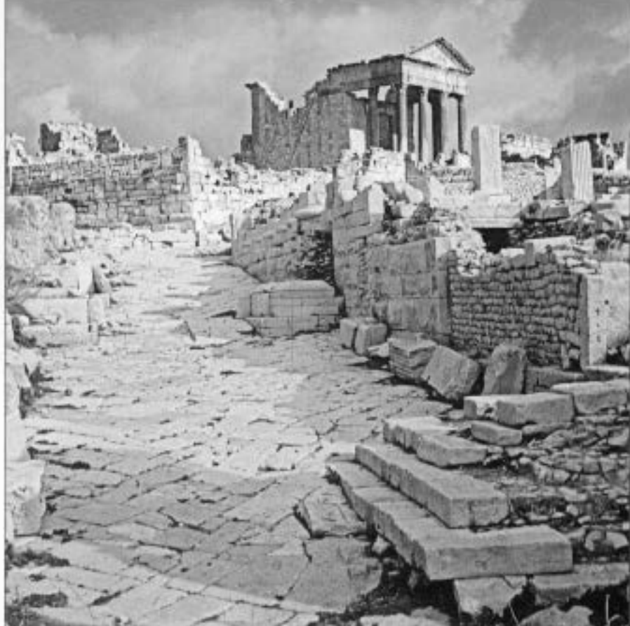
Figure 4 Part of the Roman town of Dougga, Tunisia.

The classical Mediterranean civilizations are, by contrast, well represented. Turkey has the Hittite site of Hattusha, Nemrut Dag and Troy. There are many classical sites across North Africa: Leptis Magna in Libya, Carthage and Dougga in Tunisia (Fig. 4), Tipasa in Algeria and, in Morocco, Timgad and Volubilis (where a team from the Institute of Archaeology is working).6 In southern Europe there is a similar wide range of famous sites, from Mérida and Tarragona in Spain, through Arles and Nîmes in France, Agrigento, Aquileia, Pompeii, and the Piazza Armerina villa in Italy, Diocletian's Palace in Croatia, Butrint in Albania, and most of the great Greek sites such as the Athens Acropolis, Delos (Fig. 5), Delphi, Epidauros,