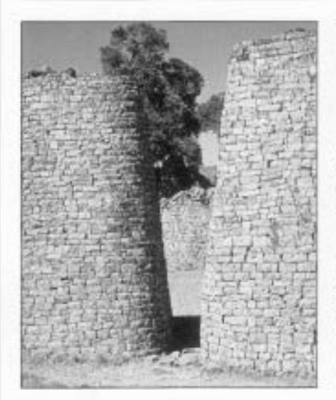
Figure 3 The northeast entrance to the elliptical building at Great Zimbabwe, Zimbabwe.

ruins of Great Zimbabwe (Zimbabwe, Fig. 3) and the slightly earlier settlement of Mapungubwe (South Africa), which has a particularly dramatic location.