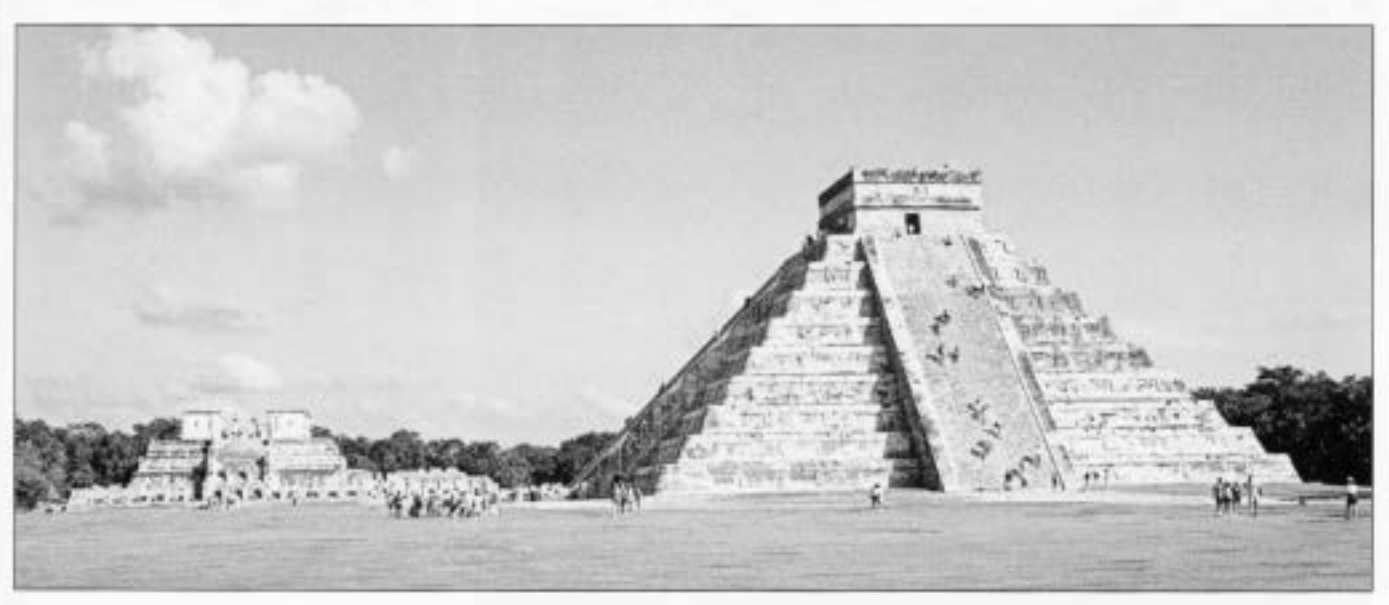
Figure 7 The pyramid of Kukulcán (El Castillo) and in the background the Templo de los Guerreros at the Mayan site of Chichén Itzá, Yucatan, Mexico.