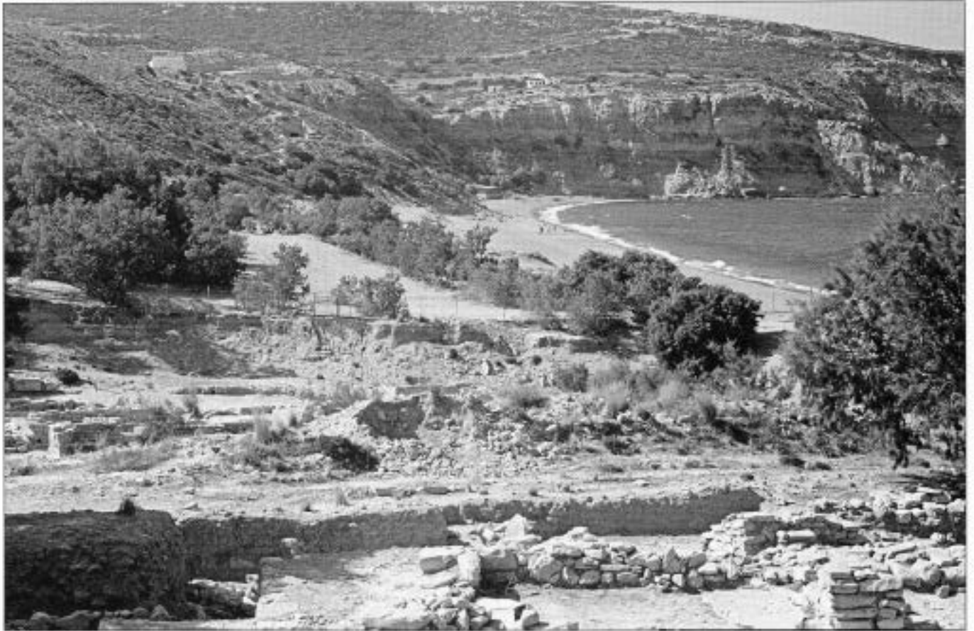
Figure 5 The site of Kommos on the south coast of Crete, seen from the northeast.