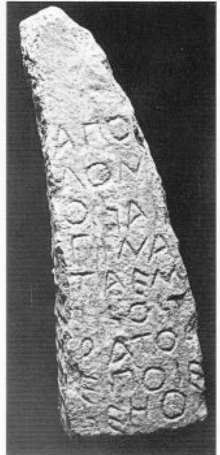
Figure 4 Part of a marble anchor stock, 1.15 m long, with a dedication to Aeginetan Apollo by one Sostratos, from the sanctuary and trading post of Gravisca, the port of Etruscan Tarquinia, c. 500 BC.

Menelaos' fleet returning from Troy was split in two at Cape Malea; to reach the south coast of Crete, one squadron would have passed through the Kythera–Antikythera island chain (Fig. 1). The latter is famous as the location of a first-century BC wreck that was the source of many bronze statues, recovered by sponge-divers in 1900–1901, but the former has never quite hit the headlines – yet. In the 1960s the British School at Athens conducted excavations under Nicolas Coldstream and George Huxley at the port of Kastri on Kythera, 12 and during the past four years Cyprian Broodbank has led an Institute