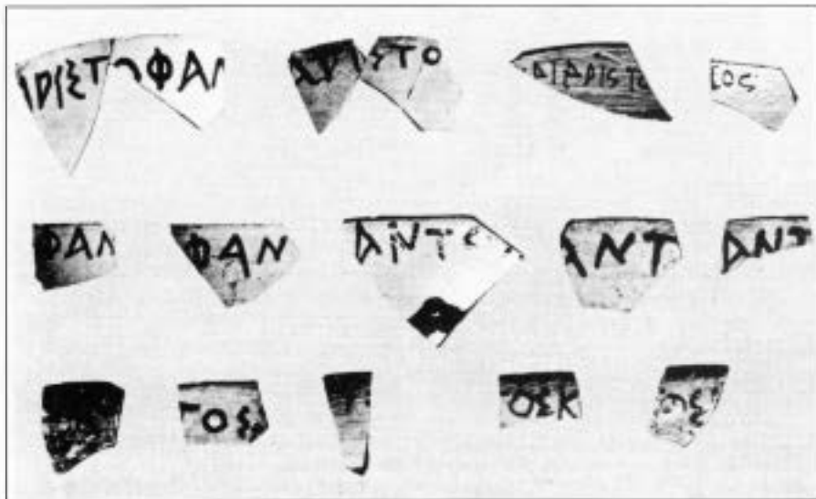
Figure 3 Some of the Chian cups dedicated by the trader Aristophantos at the sanctuary of Aphaia on Aegina, c. 550 BC.

However, on the tiny (700×250 m) islet of Mikridragonera (Fig. 1) off an island (Dragonera) off an island (Kythera), our Greek government colleague, Aris Tsaravopoulos (a UCL alumnus) has found clear traces of a sailors' sanctuary. Here, together with pottery of the Hellenistic and early Roman periods, which are not well represented on Kythera itself, he has discovered a variety of coins that include pieces from a very far-flung range of mints, from the Black Sea to Ibiza in the western Mediterranean. 14 At the sanctuary on Mikridragonera, many sailors also dedicated their finger rings to a deity not yet named in any known text.