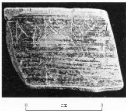
Figure 6 Graffito in Boeotian script on a local drinking cup from Kommos, seventh century BC; this is an owner's inscription; similar scraps of text found may be dedications and one is an alphabet row.

the trading stations of the Po valley and the head of the Adriatic could be reached (Fig. 1). At both these sites the perspicacity and persistence of Branko Kirigin of the Split Archaeological Museum have reaped rich rewards. Palagruza is close to the centre of the Adriatic, a speck with a lighthouse on it. Yet it has recently yielded to archaeologists in a short excavation season (as well as to passing sailors) a remarkable range of finds: a significant quantity of early Neolithic material, then a gap until the early