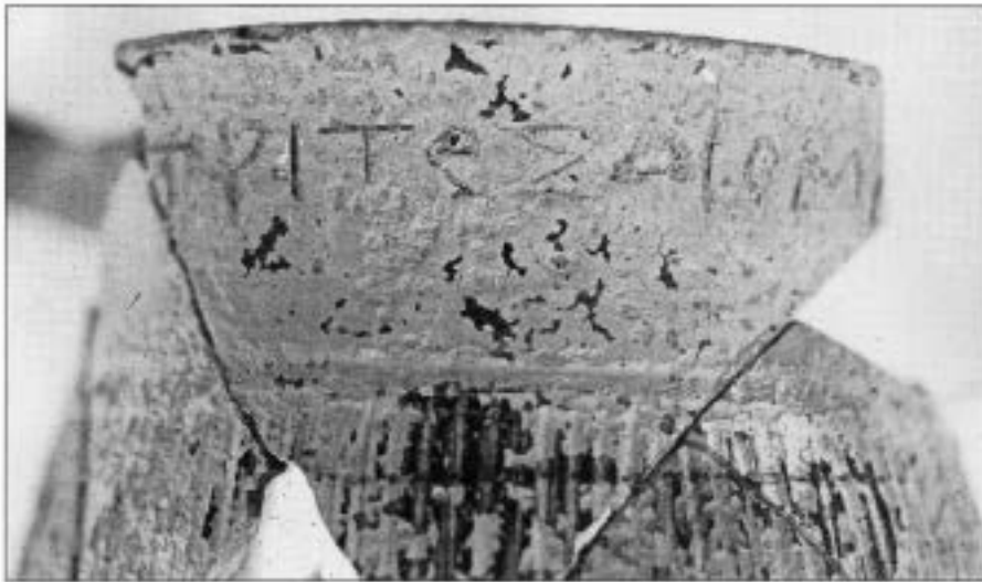
Figure 8 Dedication on rim of a cup from Punta Planka, width of upper rim c. 10 cm; one of the better preserved texts, with the name of the dedicator, Tritaios, and the recipient, Diomedes; probably second century BC.

Bronze Age, and then silence again until the late sixth century BC. The later material displays a marked similarity to the vastly greater quantity found at the two prime sites on the Po delta, Adria and Spina (Fig. 1), which suggests that the island was a stopping point for boats on the long haul north. 18 Some 50 of the sherds are inscribed, and from two of them we can deduce the name of the dedicatee – not an Olympian, not the Dioskouroi, but the Trojan hero Diomedes (Fig. 7). His “presence” in the area is known from literary sources. The early ones describe how he fled west after his return home from Troy, and the later ones tell of the foundation of towns by the returning hero. The latter have been dismissed as later rationalizing myth, but now we have to reconsider the myth history of the region back into the sixth century.