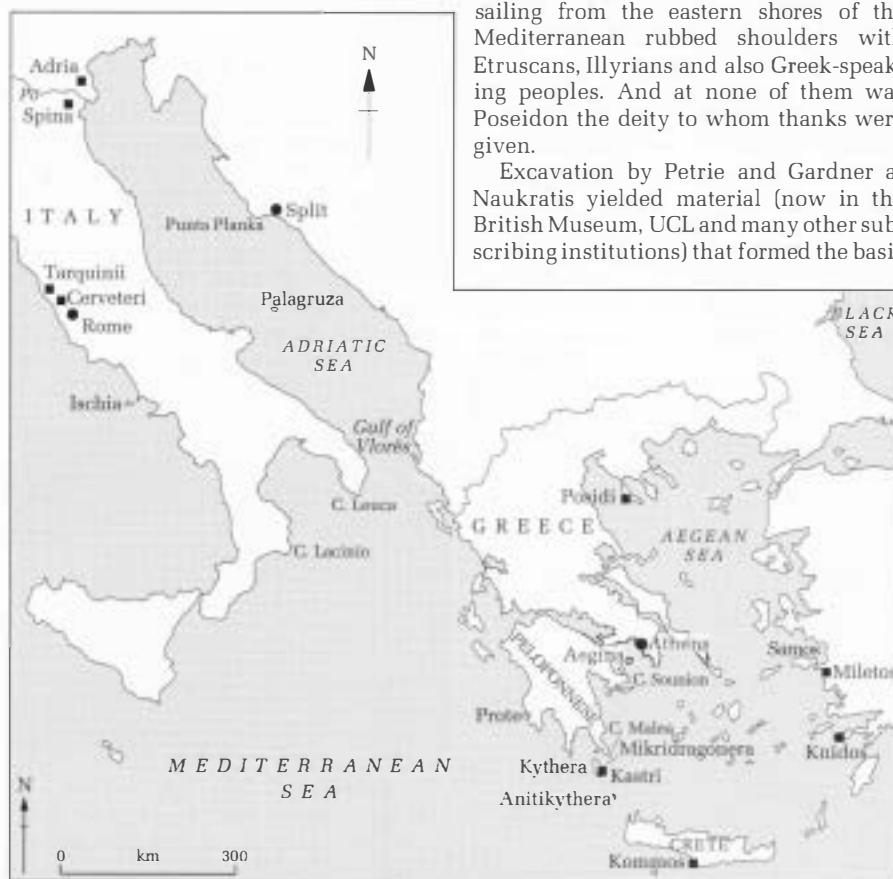
Figure 1 The eastern Mediterranean showing the location in the area of geographical features and ancient sites mentioned in the text.

Naukratis was a safe port in the Nile delta. Aegina was scarcely in the midst of raging seas (although the Saronic Gulf can cause some marine nail biting). Other sites are