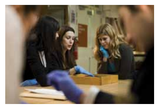
Fig. 1: Teaching in the newly refurbished Petrie Museum.

My job as Audience Development Officer at the museum is to raise its profile (both within the University and externally), increase its usage, expand audiences and run engaging learning activities. There has been a regular public programme at the museum since 2007, and interest in the talks, films and trails we put on has increased. One of the good things about being a 'smaller' univer-