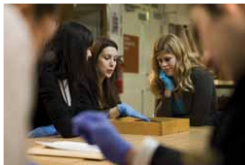
Fig. 1: Teaching in the newly refurbished Petrie Museum.

My job as Audience Development Officer at the museum is to raise its profile (both within the University and externally), increase its usage, expand audiences and run engaging learning activities. There has been a regular public programme at the museum since 2007, and interest in the talks, films and trails we put on has increased. One of the good things about being a 'smaller' univer-