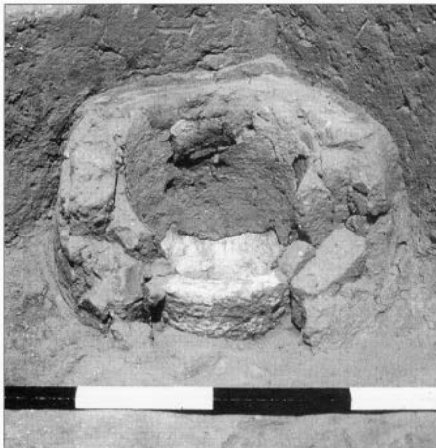
Figure 5 A limestone mortar with a built-up mudbrick and plaster rim, placed in the corner of a village house at Amarna (scale bar intervals 25 cm).

enough to be used now. So instead I made replicas of these tools, based on specimens excavated from arid settlement sites or recovered from tombs. Excavations showed that the ancient Amarna villagers built elaborate mudbrick and plaster rims around their mortars (Fig. 5) or simply set the mortars into the ground with the rim protruding slightly. For the experiments, it was easiest to place the ancient mortar in the ground. Most Amarna village houses also had box-like mudbrick and plaster emplacements. These raised the flat grinding stones off the ground, making the milling process easier and quicker. I built a grinding emplacement that had the same construction and dimensions as the archaeological specimens.