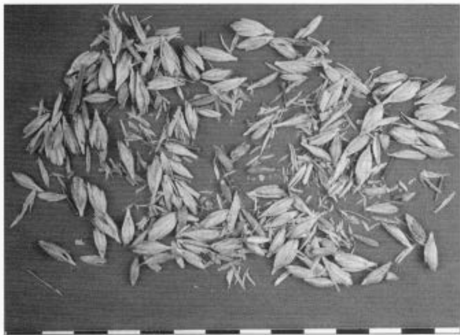
Figure 7 The shredded emmer chaff generated by experimental pounding as shown in Figure 6, together with whole, freed grain (scale bar intervals 1 cm).

Although hand milling is rightly considered an arduous process, using an emplacement to raise the grindstone off the ground makes milling much quicker and easier. The miller is in close control of the grinding process, and the texture of the flour can be adjusted precisely. A few strokes of the handstone against the lower