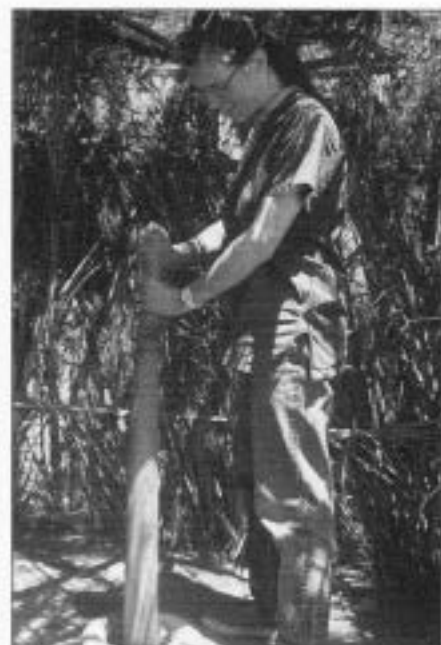
Figure 6 The author using an ancient Egyptian limestone mortar and replica wooden pestle to de-husk emmer wheat.

ing and the noise made by the pestle on the contents of the mortar change when the spikelets are shredded, so it would have been easy to tell when to stop. Apart from