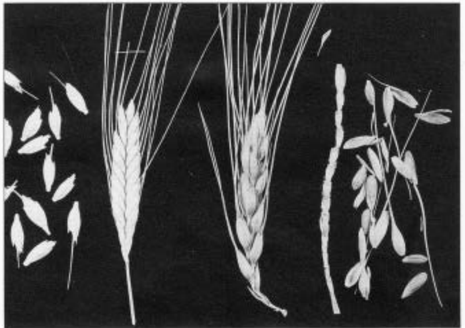
Figure 2 Threshed hulled wheat (left) and free-threshing wheat (right). The threshed hulled wheat ear falls apart into spikelets whereas the chaff of free-threshing wheat falls cleanly away from the grain.