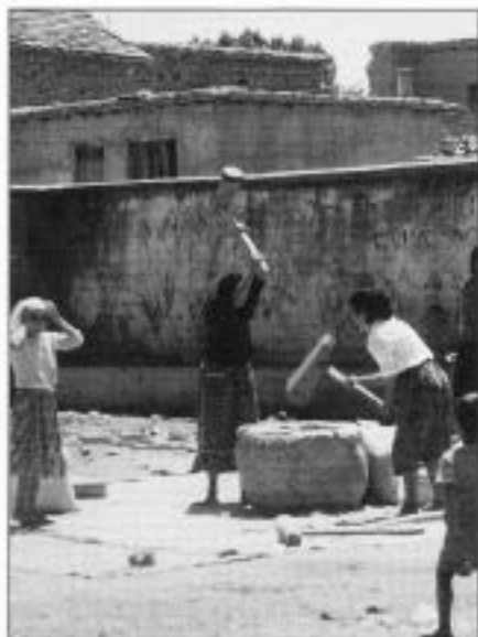
Figure 3 Women in a Turkish village de-branning grain for bulghur using a large stone mortar and wooden mallets, 1991.

readily. When bread wheat is threshed, it is easy to free the grain from the ear, but when emmer is threshed the ear falls apart into little packets which are known as spikelets. They consist of the grain tightly enclosed in chaff. Skilled extra work is needed to break up the chaff to free the grain without crushing it.