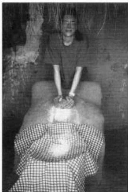
Figure 8 The author grinding flour with an ancient Egyptian handstone and grindstone set in a replica emplacement.

flatstone produces a coarse meal, and several more strokes rapidly create a fine flour (Fig. 8). Like the pounding process, however, the milling sequence must be repeated over and over again because only a small quantity of grain can be processed at a time.