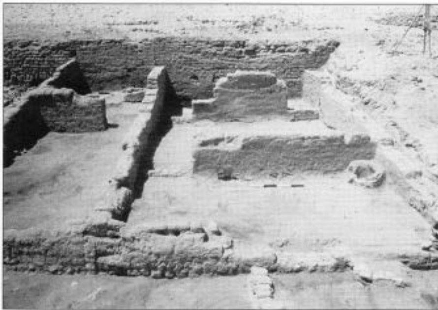
Figure 4 The foundations of a house in the workmen's village at Amarna, showing the position, against the right-hand wall, of the circular limestone mortar illustrated in Figure 5.

Many of the stone tools excavated at Amarna are in excellent condition and they presented an ideal opportunity to try experimental reconstruction of emmer processing. The equipment made from organic materials, such as wooden pestles and wooden and grass sieves, is not robust