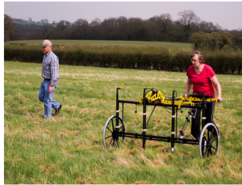
Fig. 2: Magnetometry survey in progress in Hertfordshire as part of the AHRC-funded project 'Sensing the Iron Age and Roman Past'.