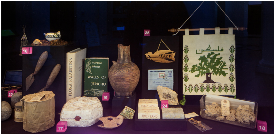
Figure 6: Palestinian material displayed in the Talking Objects case in the Moving Objects exhibition.

existence, through the 1937 founding donation by Mary Woodgate Wharrie (Drower 1985: 379–380; Ucko 1998). A key site in that collection is Tell el-Ajjul, in the territory of Gaza, where eight camps now house one and a quarter million Palestinian refugees. What do people in London make of this? The Institute has special reason to respond.