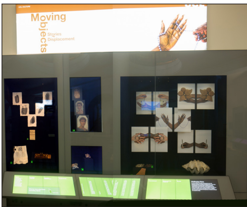
Figure 5: The Challenging Views case in the Moving Objects exhibition.

This year the migration crisis debate arrived tangibly and materially at the heart of UCL, in the Octagon below its central dome, through an exhibition that seeks to convey the words and actions of the displaced. The display-case on Being in Place sets a base-line in the current ecological catastrophe, of endangered species and livelihoods, evoked in fish-trap and pangolin. The mood here is muted, a darker space punctuated by the animal bodies, select artefacts, and works on bright paper. Diametrically opposite, Challenging Views (Figure 5) confronts the starkest inhumanity of humans to each other, where the speaking subjects are those who have lived through torture. The Helen Bamber Foundation works with survivors of human cruelty; to say what we might not bear to hear, the students in its Photography Group (Helen Bamber Foundation n.d.) bring select museum artefacts underpinning colour pictures of hands holding those objects from their workshops. Beside the group