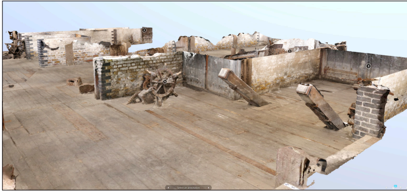
Figure 2: Ground floor of the House Mill photogrammetrically modelled and annotated to allow virtual tours.

with the Institute's Conservation, Lithics and Photography laboratories is also shaping up. An ever-increasing number of enquiries from staff and students on possible uses of the laboratory and equipment shows that this endeavour is very timely.