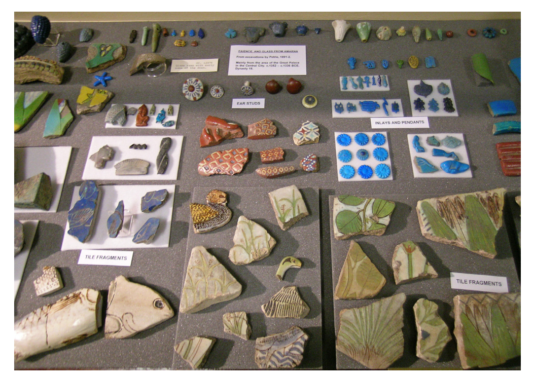
Fig. 4: A small part of the 1,000+ faience tiles, inlays and moulds from Amarna (Petrie Museum: display case WEC11).

three dimensions. A new 3DPetrie website is under development.