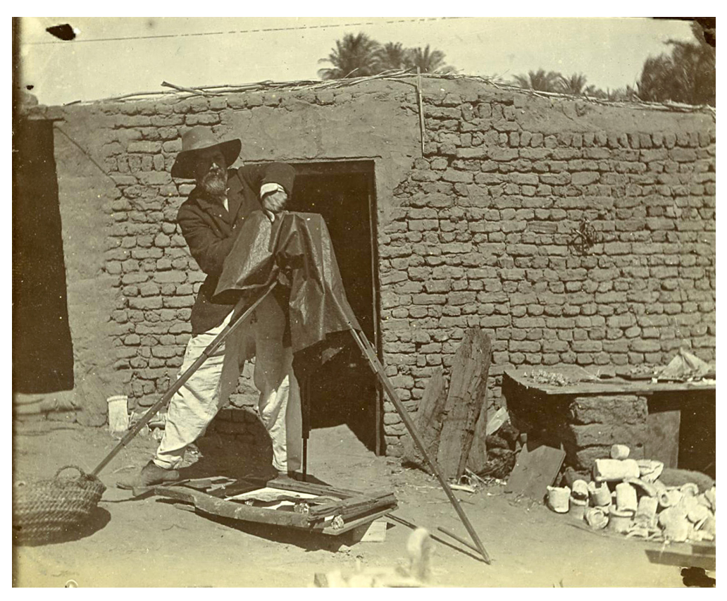
Fig. 1: 'Flinders, taking Khasekhemui bronzes etc. in front of store hut' (from Margaret Murray's photograph album, Abydos 1902). Petrie was a pioneer of archaeological photography as well as 'the father of Egyptian archaeology'.

ongoing. One researcher unable to leave Egypt described it as 'being able to hold a museum in your hand'. The challenge is to use the limited space — both display and access, onsite and online — to best advantage.