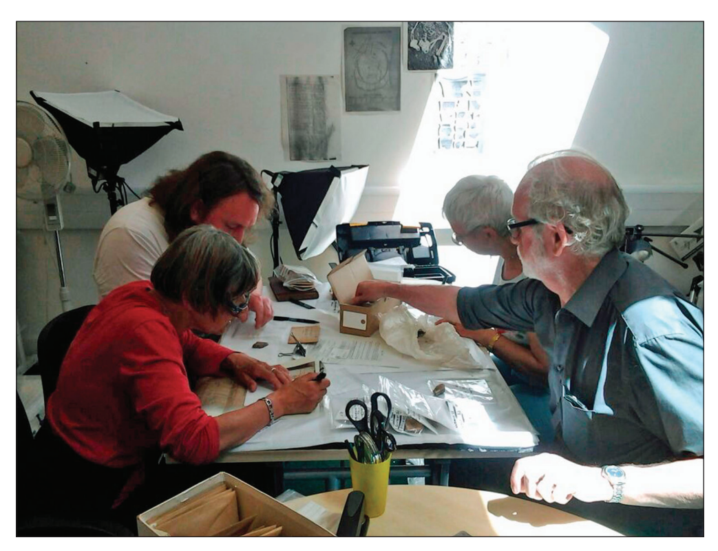
Figure 2: Project volunteers repacking the archive.

An online digital game — Stone Age Quest — (RPM 2015a) was co-developed by volunteers, professional designers, schools and RPM staff to introduce children to the site and the Neolithic period and to address teaching needs associated with the introduction of prehistory to the National History Curriculum. The game uses Neolithic and Mesolithic cartoon characters to discuss issues relating to the building of Whitehawk Camp and to the change of lifestyle and culture at the beginning of the Neolithic period. To reach wider audiences, a free download Geolocation Story Drop App for smartphones was also developed (RPM 2015b). The App works like a historical treasure hunt, guiding participants to locations around the city of Brighton and Hove. Project volunteers created content in the form of short passages of text on objects that had particularly intrigued them.