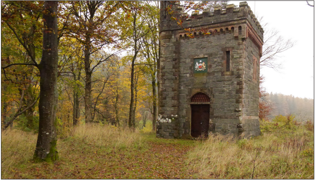
Figure 1: The pump house of Thirlmere reservoir in the Lake District hides its intervention in the landscape behind heritage tropes. Concepts of ‘forever’ overlap with ‘timeless nature’.