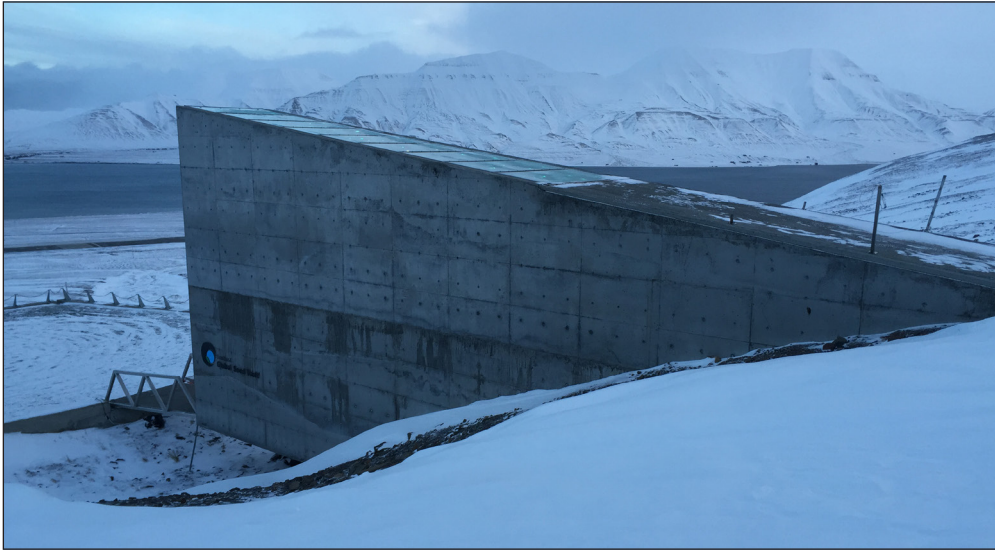
Figure 2: The Svalbard Global Seed Vault (SGSV), located on the island of Spitsbergen in Arctic Norway, is one of the Heritage Futures programme partners. Co-operated by Nordgen (the Nordic Genetic Resource Center) and the Global Crop Diversity Trust, it aims to provide a secure repository for the maintenance of global crop diversity.

and experimental exhibition work (after Macdonald and Basu 2007). The outcomes of the project will be shared with practitioners, policy makers and academics through a range of outputs, including training and capacity building resources, policy briefings, short films, books and journal articles.