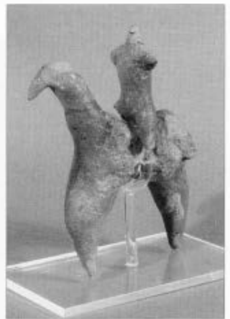
Figure 4 The early horse-and-rider statuette from Horizon 4 at Tongo Maaré Diabal, height 15 cm; conserved by Bethan Baresi at the Institute of Archaeology.

But the architectural sequence from the site remains its most provocative and important contribution. Excavating mudbrick architecture is of course not easy, as the bricks themselves consist of the same raw material as much of the collapse that surrounds them. But, through trial and error we have found that the wetting of excavated exposures, and arduous scraping after the removal of each stratigraphic horizon, expose sufficient differences in colour and texture to allow us to discern individual bricks, ashy room floors, and sandy yard areas. Such a procedure was aided at Tongo Maaré Diabal by good preservation of wall and surface features such as hearths and stone features, as well as intact pots, of which nearly 30 were recovered (Fig. 5).