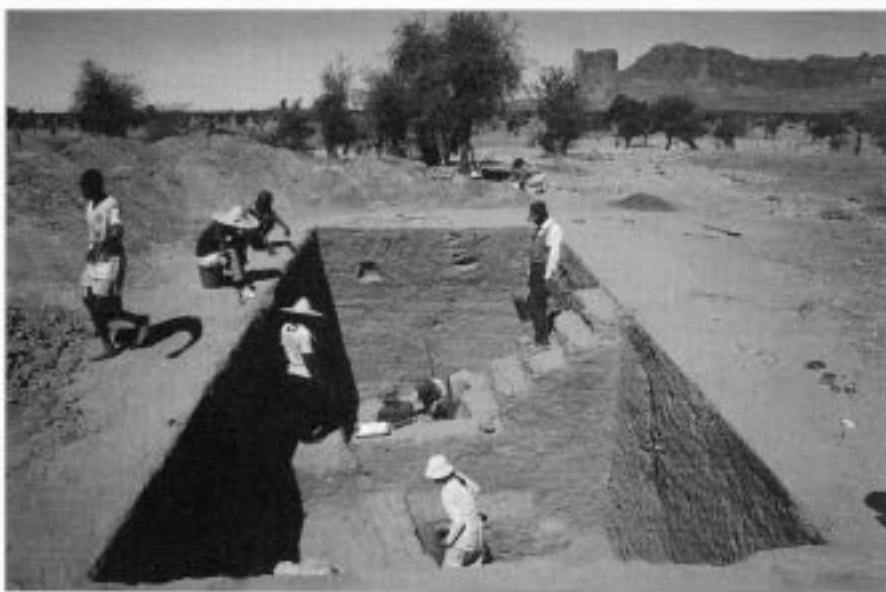
Figure 3 The main exposure at Tongo Maaré Diabal mid-way through the 1995 season.

Although analysis of our findings from the three excavation seasons at the site are still in progress, it is possible to indicate some salient points about the site and their relevance within the "big picture" of Middle Niger archaeology. The site was founded on top of a levee at the extreme