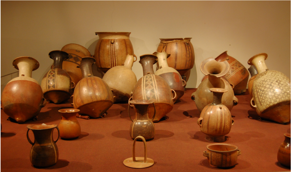
Fig. 1: A display of classic Inca pottery in the Museum of the Universidad de San Antonio Abad del Cuzco. The largest vessels are around 1.20 meters tall from conical base to flaring rim.

petrographic characterisation of the pottery fabrics (Ixer and Lunt 1991). Bill Sillar also worked on the Cusichaca project and studied at the Institute of Archaeology with Warwick. Much of his research has focused on the ethnography of Andean pottery production and the archaeology of Inca state development (e.g. Sillar 2000, Sillar et al 2013).