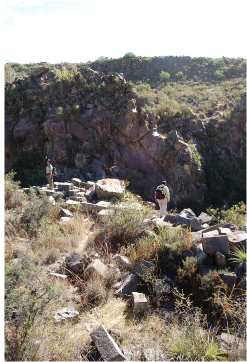
Fig. 4: Inca carved andesite blocks within the Rumiqolqa quarry, Dennis Ogburn to the left and Julio Cesar Sierra to the right.

In an article published in the first edition of the graduate journal Papers from the Institute of Archaeology , Hunt (1990) provided petrographic descriptions of these same andesites. He described the Rumiqolqa samples as 'hornblende andesite, with primary phenocrysts of plagioclase feldspar, basaltic hornblende and biotite; there is a little pyroxene and occasional xenoliths of apatite and ilmenite'. The Huaccoto samples were described as 'biotite andesite, with phenocrysts of plagioclase feldspar and biotite; hornblende is present but infrequent' (ibid. 26, 27). Hunt matched these petrographical differences with differences in colour and physical properties, which served to