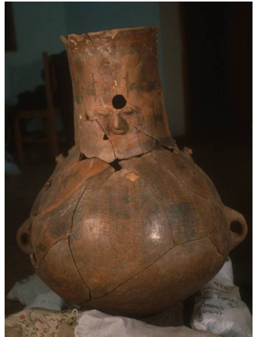
Fig. 2: A large Lucre style face neck jar with conical base (87 cm tall by 60 cm diameter).

Rowe's descriptions of Cuzco Inca pottery identified seven stylistic sub-groups, which together he called the Cuzco Series (Rowe 1944, 60). The fabric ('paste') was also described (Rowe 1944, 47). This fabric, the ATF, has been studied in detail subsequently (Ixer and Lunt, 1991: Ware 13). It is highly standardised, based on very clean clay with few accessory minerals and tempered with andesite in uniform sizes, shapes and quantities throughout the samples. Although other fabrics were also used to make Cuzco Inca pottery, the ATF predominates. The pottery was coil-built. The forms are made in a range of modular sizes and include the pointed-based, long-necked aryballus, wide-mouthed storage vessels and small plates and bowls. It was painted, predominantly with small rectilinear motifs, using similar colours and designs to Killke, but the Cuzco Inca decoration is of a markedly higher standard, with precise and richly-textured patterns built up