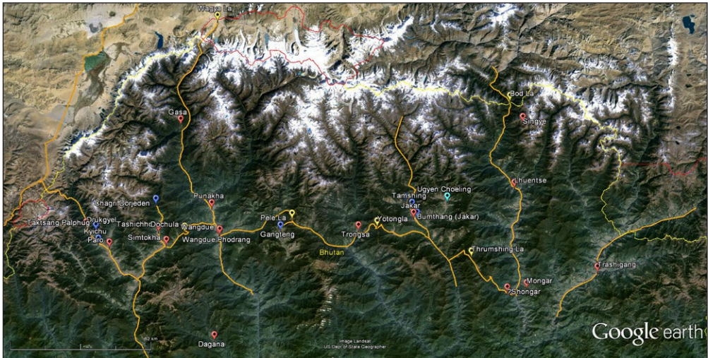
Figure 1: Distribution of major dzongs (red), monasteries (blue), and the most significant mountain passes (La in Dzongkha) (yellow). Suggested major routes through the high valleys marked in orange.

Tibet, Sikkim and Nepal. The route north from Punakha (the early capital) via the Wāgya La pass, and in the east, the route via the Bod La Pass, were probably also important. However, the northern passes, at nearly 5,000 m, and even the Tremo La pass