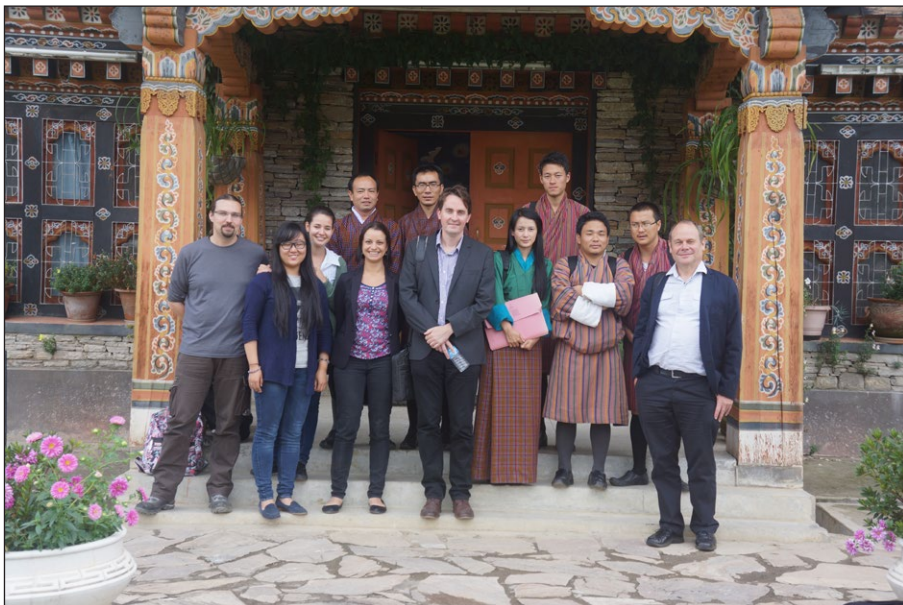
Figure 3: The August 2014 workshop members outside the National Archive building (Photo author).

A workshop in Bhutan in August 2014 (Williams in press), involving staff from University College London (UCL) and the DCHS ( Fig. 3 ), focused on approaches to