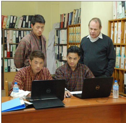
Figure 4: Hands-on training and discussion during the February 2016 workshop (Photo author).

As many as ten of these can be received each week. A record of decision-making, expenditure, materials requested, etc. is kept and plays a key part in current Bhutanese built heritage management. This would be a substantial addition to the system and not one that ARCHES, an inventory system,