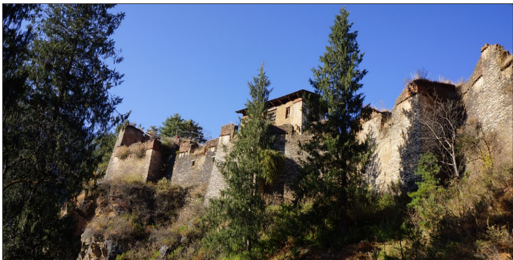
Figure 2: Drukgyel Dzong, ‘fortress of the victorious Drukpas’, built in 1647 to commemorate victory over the attempted invasion by Tibeto-Mongol forces in 1644 (Pommaret 2009, 138). The location is strategically vital to protect the Paro valley and it became important for controlling the trade with Tibet via the Tremo La pass.