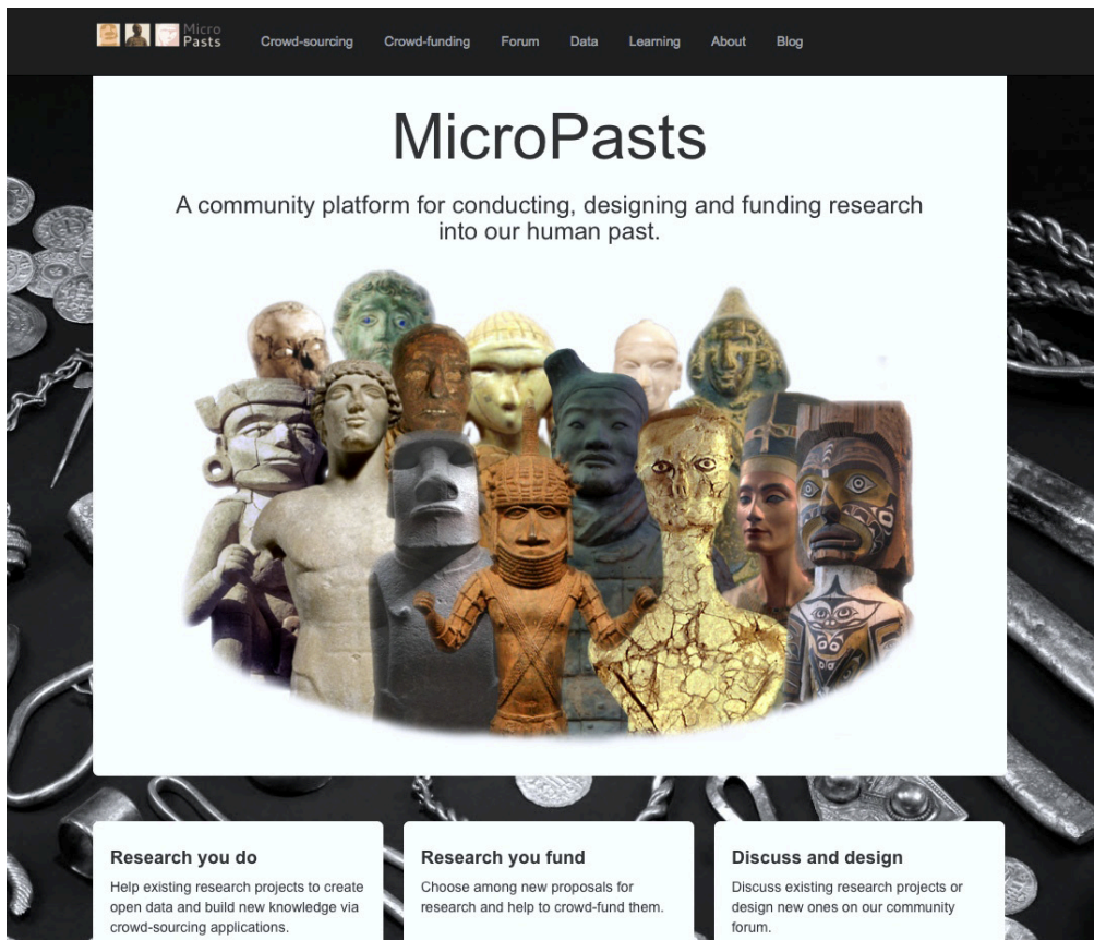
Fig. 1: The homepage of the MicroPasts website micropasts.org.

of the public to first participate in crowd-sourcing and only subsequently in the design of new projects and in crowd-funding, we are nevertheless also enabling each of these activities to be undertaken independently from one another.