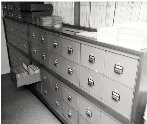
Fig. 3: The National Bronze Implements Index.

proportion of the metal artefacts discovered in England and Wales from the 1990s to the present day. By combining these two databases, the MicroPasts project will complement the public facing nature of the PAS as well as form potentially one of the largest digital archives on prehistoric metal objects anywhere in the world.