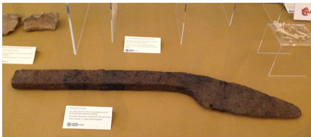
Fig. 1: The Lyminge coulter on display in Maidstone Museum (Photo: John Merkel).

iron plough coulter from Bigbury Camp, Kent. It was successfully identified as iron, but the mineral constituents on the surface seemed unremarkable. Identification of minerals, such as different iron oxides, was then based upon visual observations and long experience alone.