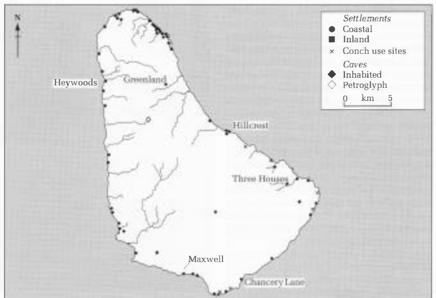
Figure 7 Barbados: distribution of prehistoric sites. Sites mentioned in the text are named.

mainly conch-lip adzes and mollusc shells, indicates small mobile groups moving among the islands of the Lesser Antilles. They adapted to local resources, making cutting and scraping tools on islands with stone, but on stoneless Barbados the queen conch was used instead. The first permanent settlements are represented by people using pottery of the Saladoid tradition, which stylistically can be linked back to mainland South America, particularly the northeastern Venezuelan coast and Orinoco Basin. Once settled by pottery-using peoples, Barbados developed its own insular traditions, although it kept close links with neighbouring islands and perhaps even with the mainland.