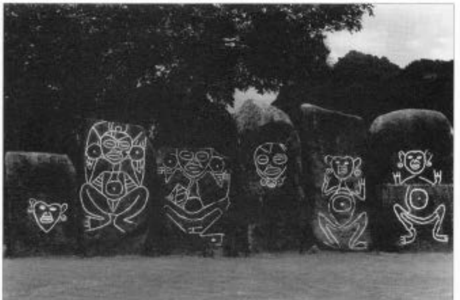
Figure 2 Iconography at the site U-10, Caguana ceremonial centre: the cacique or chief (head only) is flanked by pairs of high-ranking ancestors (left) and low-ranking figures (right).