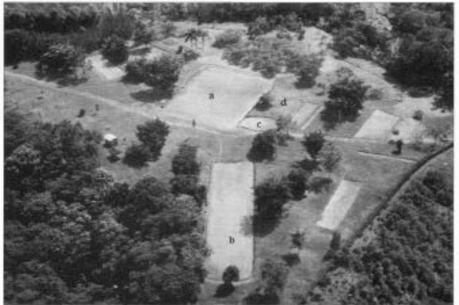
Figure 1 Aerial view of site U-10 showing (a) a large plaza used for ritual dances (areito), (b) a rectangular area used for the Antillean ball game (batey), (c) a small oval plaza, and (d) an area where evidence of houses has been found.