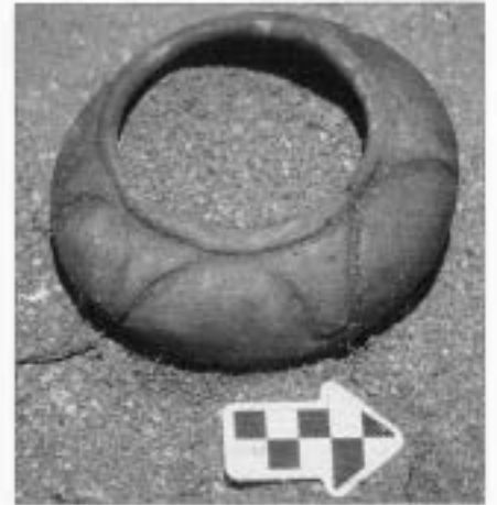
Figure 6 Belmont Archaeological Project, Tortola, British Virgin Islands. Pot deposited in ceremonial area towards the centre of the Amerindian settlement site.

Recently, work has concentrated on the Heywoodssite north of Speightstown, where an entire prehistoric landscape is being revealed during the construction of a marina at Port St Charles. 8 Preliminary test-pit survey has indicated three major phases of occupation. First, the marine inlet was the focus of activity by a pre-ceramic fishing and foraging community around 2000 BC. Secondly, a small village represented by round houses of the late Saladoid–Troumassoid ceramic periods (c. AD 600–1100) was established, and finally a substantial Suazoid midden represents prehistoric activity from about AD 1100 to 1400. It is likely that the pre-ceramic material,