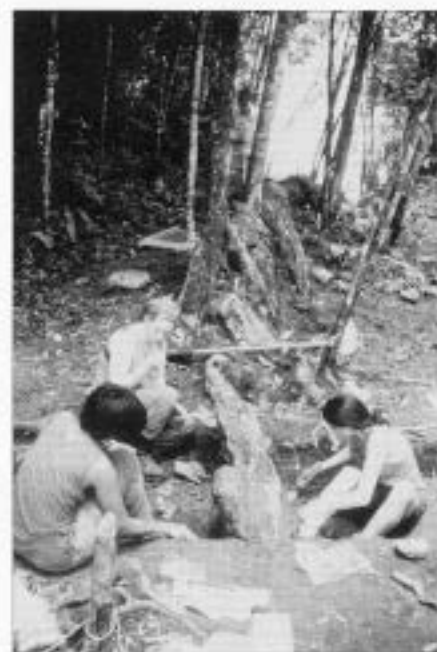
Figure 4 Excavation in progress at Trench A on the southern side of the batey court, site U-53, Caguana.

Excavations so far have been located towards the centre of the settlement. Apart from the remains of one small round building, most of the area excavated was probably open space within the centre of an oval or round village. Ceremonial activities took place within this space. Two pairs of stones were found set on edge and aligned with the summit of Belmont Hill, the conical hill that dominates the site. Around the stones were carefully placed whole pots (Fig. 6), a carved conch vomit spatula, a triton shell "trumpet", and food refuse dominated by top shells ( Cittarium pica ), together with a