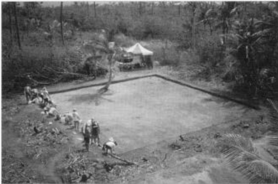
Figure 5 Belmont Archaeological Project, Tortola, British Virgin Islands. Area excavation in 1997.

wide range of other mollusc shells and fish bones. Preliminary identifications of the fish bones by Dr Elizabeth Wing (University of Florida) include jack, grunt and ray. All the evidence suggests that Belmont Hill was itself a zemi 5 or the residence of a zemi, and that the area excavated was where the village shaman communed with the zemi, using hallucinogenic drugs following ritual cleansing using the vomit spatula. Offerings were made to the zemi using the pots and are represented in the archaeological record by fish and shellfish remains. It is hoped that future excavations will put these ceremonial activities into their domestic context.