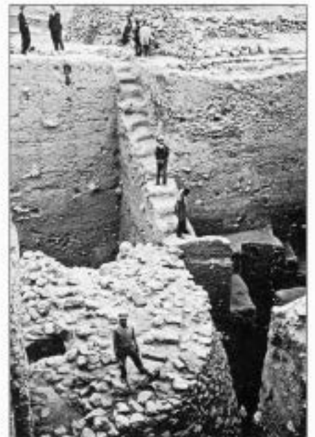
Figure 1 Part of the circular tower at Jericho (front left), with a deep excavated section beyond showing the deposits that accumulated around the tower during the Pre-Pottery Neolithic A period.

The large mound at Jericho – a tell about 20m high, 320m long and 140m wide – represents several thousand years of occupation. Kathleen Kenyon excavated at Jericho in the early 1950s when she was a member of staff of the Institute, and in the largest of her trenches she dug down to the earliest occupation layers of the settlement and exposed the full extent of a massive stone-built tower and walls that were first constructed during the PPNA (Fig. 1). 9 Together with fragments of burnt plaster