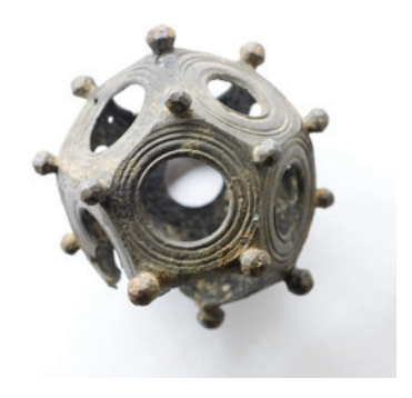
Figure 3 The dodecahedron

The Newhall villa is located approximately 1.5 km southeast of the known extent of the Roman town and appears to have been one of a number of villa residences occupying its immediate hinterland. Following the villa's demise, the site may have continued as a focus of activity into the early medieval period when two distinctive sunkenfeatured buildings of fifth- to seventh-century date were constructed in