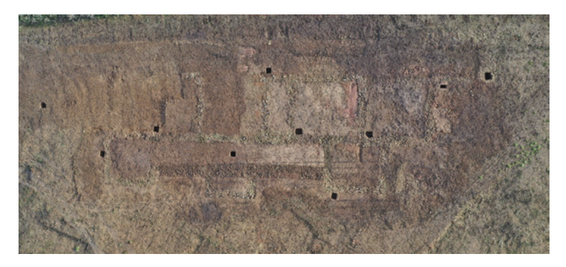
Figure 1 Aerial view of the villa Newhall Phase 2 villa remains

immediate hinterland surrounding the Roman town. During 2019–22 Archaeology South-East investigated the Newhall Phase 2 development following commission by the RPS Group. This was on behalf of their client Countryside Properties (UK) Ltd. The 2.1 ha of open area excavation produced some particularly interesting results and, although post-excavation analysis is ongoing, some insights into a few of the most significant discoveries can be made. In essence, the recorded remains comprised a Roman villa and part of its landscape (Figure 1). The excavations also encountered the depositing of metalwork in a watery place and evidence of early medieval occupation.