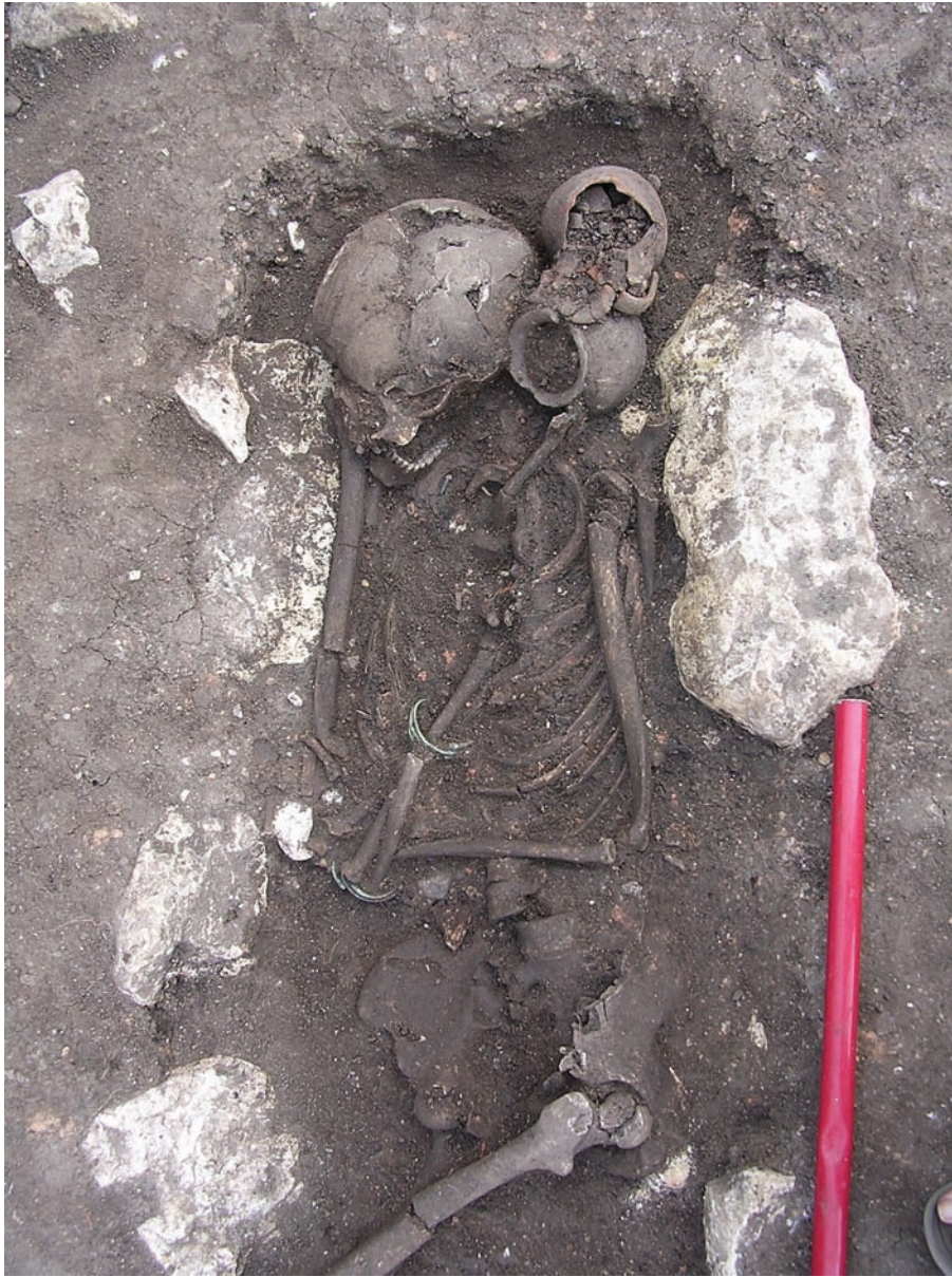
Figure 6 Adult female Hellenistic burial found in Trench A, excavated in 2007