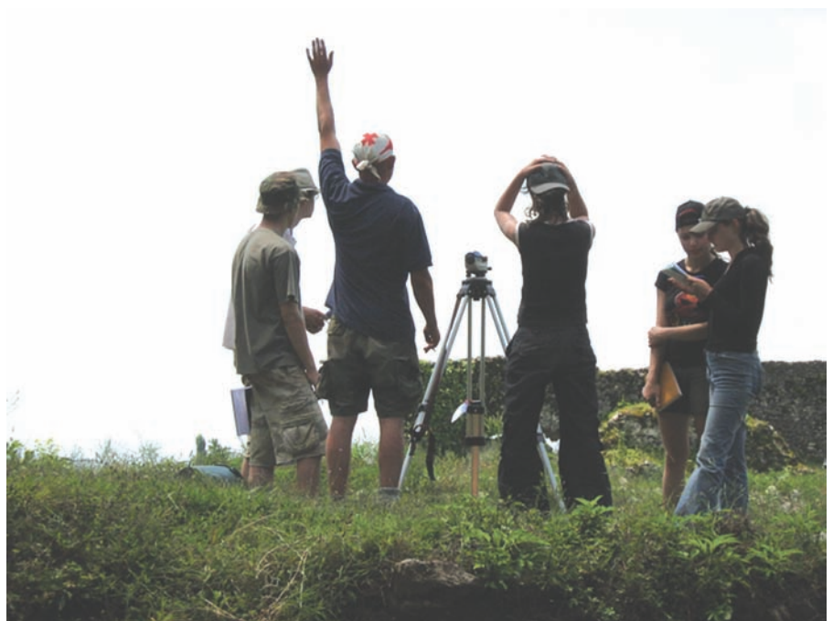
Figure 2 Georgian and British students undertake an exercise using a Dumpy level