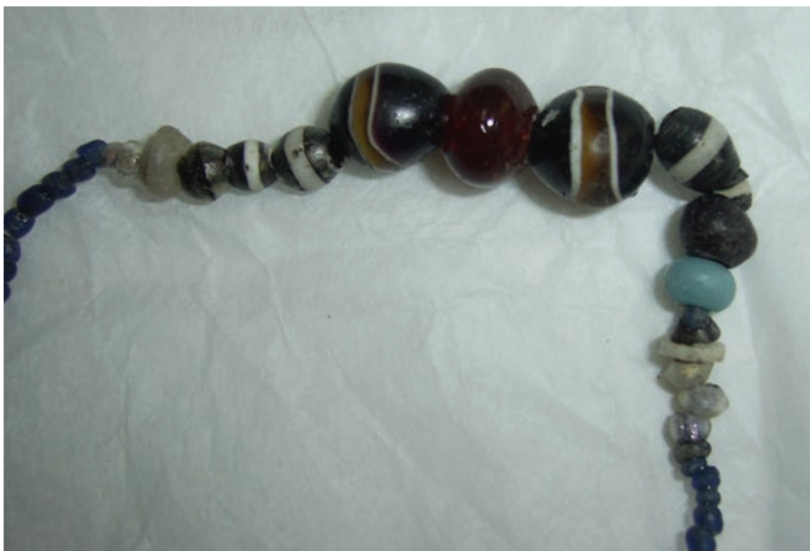
Figure 7 A restored necklace made up of beads recovered from the grave of the female individual shown in Figure 6