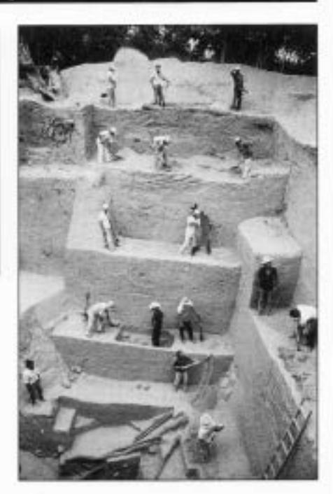
Figure 2 Excavation by Izumi Shimada of an elite tomb at Huaca las Ventanas, Sicán, northern Peru; many bundles of naipes were found in the tomb and elsewhere at the site.

not imply that primitive money of various materials (metal, feathers, textiles or shells, for example) is somehow too simple to be interesting. Naipes represent a distinctive and fascinating form of pre-Hispanic, South American primitive money.