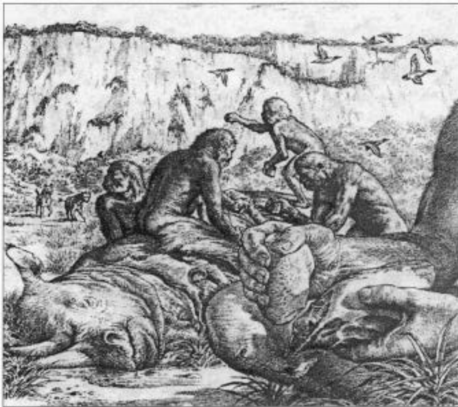
Figure 3 Reconstruction by John Sibbick of humans butchering a rhinoceros carcass at the Boxgrove waterhole site. Stone biface tools were manufactured here with which large mammal carcasses were systematically processed, including the extraction of bone marrow (right foreground). The humans would have defended such valuable carcasses against other carnivores such as scavenging hyaenas (left background).

remains of large mammals. A picture began to emerge of the life and environment of the people who had occupied a landscape in which, towards the end of an interglacial period, a retreating sea had created an intertidal environment of saltmarsh and grassland overlooked by an imposing line of high chalk cliffs fringed by a beach (traceable today as the Boxgrove raised beach, Fig. 1). There was a ready supply of flint – the raw material for all the stone tools found at the site – in the talus (scree) slopes at the base of the cliff, and large herds of herbivores grazed amid the open grassland and freshwater springs of the lowlands below. The animal-bone evidence showed that the people were gaining access to carcasses of horse, red deer, rhinoceros and bovids such as bison. They were using the tools to extract meat and bone marrow (Fig. 3) but they had to compete with other carnivores such as wolf, hyaena and lion, whose gnaw marks were found to overlie the fine tracery of flint-tool marks on some of the bones. Some extensive activity areas, such as a horse butchery site (GTP17), perfectly preserved the evidence of butchery in the form of scatters of flint fragments left over from making (knapping) stone tools on site (Fig. 4). The knapping scatters surrounded the remains of a large horse and provided a snapshot of a few hours of activity left virtually untouched since the human group moved on, sated on horse flesh, some