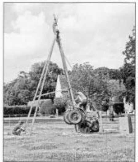
Figure 6 Sampling geological deposits with a borehole rig at West Stoke, 8 km west of Boxgrove. The sedimentary sequence in the core obtained here was found to be identical to that recorded at the Boxgrove quarry.

The results of the Raised Beach Mapping project show that Boxgrove should no longer be considered a single, isolated site. Instead, we now know that it is at the heart