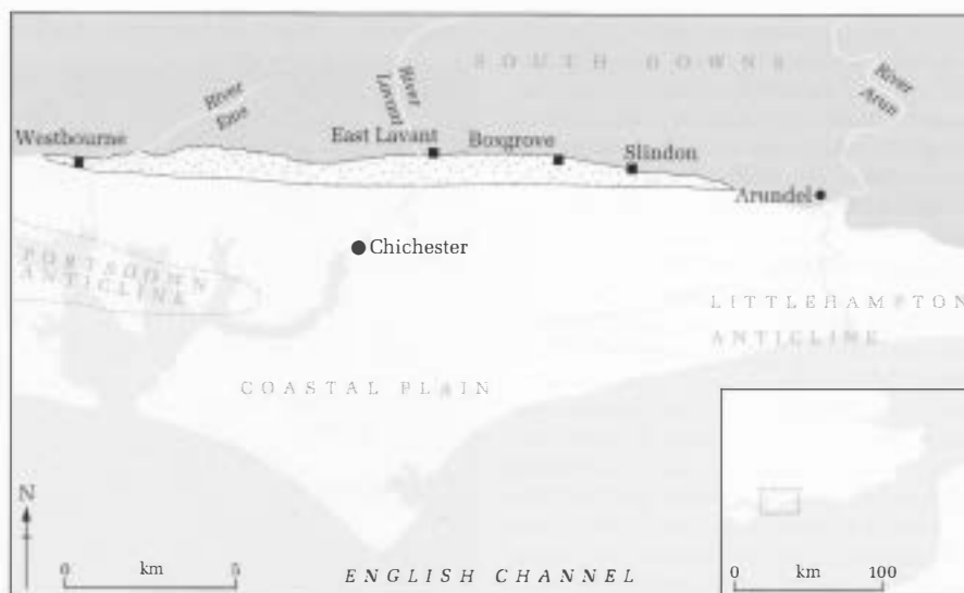
Figure 1 Location of the Lower Palaeolithic (Middle Pleistocene) site of Boxgrove, West Sussex, and of other Lower Palaeolithic sites mentioned in the text. The stippled area represents the deposits of the Boxgrove raised beach.

As the project developed, over 90 areas of the buried prehistoric landscape were sampled, producing evidence of exceptionally well preserved areas of human activity associated with the butchered