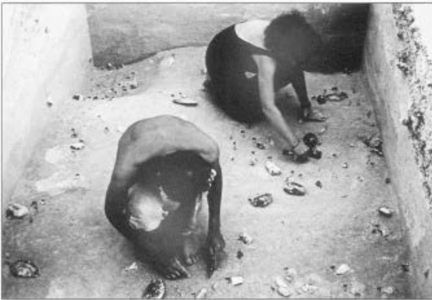
Figure 5 Excavating bifaces at the waterhole site, Q1/B. Over 450 mint-condition bifaces were recovered from the freshwater deposits at this location.

found at Boxgrove produced evidence of wounds from both bone breakage and projectile impact. The latter evidence supports finds from Lower Palaeolithic sites at Clacton in Essex and Schönningen in Lower Saxony (Germany), which suggests that humans were hunting large mammals with wooden spears. This evidence, together with the observation that butchery marks underlie carnivore gnaw marks, suggests that the Boxgrove people were competent hunters at the top of the food chain, who used tools and exploited the land in complex ways. 5 Finds of resharpened tools, and of hammers made of antler and used in the production of the fine bifaces, suggest that the hunters routinely curated valued tools, frequented areas such as waterholes where game was intercepted, and systematically defended and exhaustively butchered animal carcasses (Fig. 3). The local availability of fertile grassland, fresh water and abundant raw material for making tools would undoubtedly have attracted human groups. These factors, combined with the excellent conditions of preservation at the site and the use of modern excavation techniques, have combined to make the record of human behaviour at Boxgrove the most complete for any Lower Palaeolithic (and Middle Pleistocene) site in Europe.