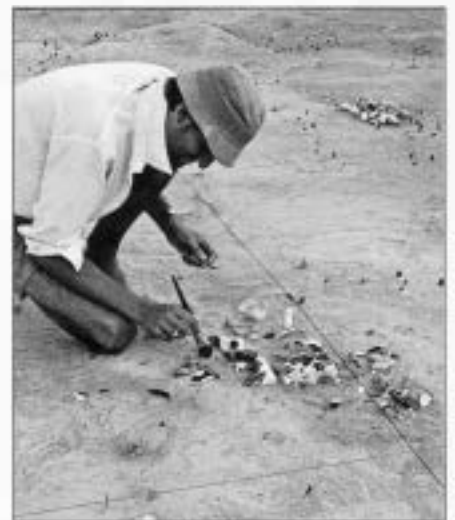
Figure 4 Excavating in situ knapping scatters at the horse butchery site GTP17.