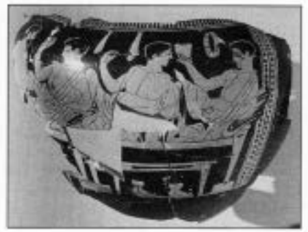
Figure 4 Imported Greek (Attic red ware) pottery from the Iberian oppidum of Ullastret.

A major crisis extending from the fourteenth to the fifteenth century has also been recognized as a key period in the structuring of social space. This is largely a consequence of a combination of climatic deterioration, a sequence of bad harvests and the onset of the Black Death. We are studying the relationships that may have