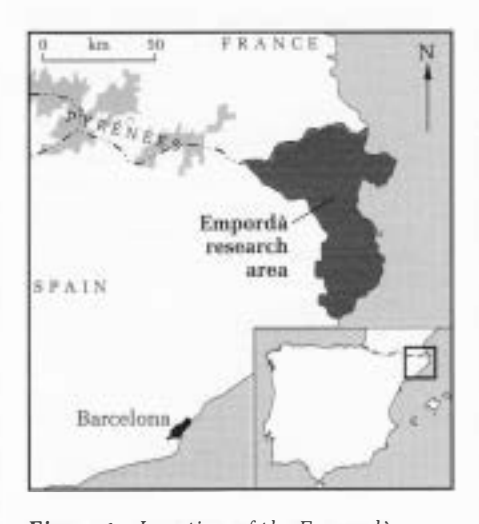
Figure 1 Location of the Empordà research area.

The main aim of the Empordà project,<sup>1</sup> begun in 1996, is to examine the evolution of social space in the region and to demonstrate how the present-day landscape is a consequence of processes contingent on historical events, thus underlining the fact that past decisions form the initial conditions of what are often perceived as present-day crises. An additional aim is to provide social and environmental data relevant to contemporary debates on the sustainable future of the Mediterranean generally. In particular, the research seeks to examine the role of social and political