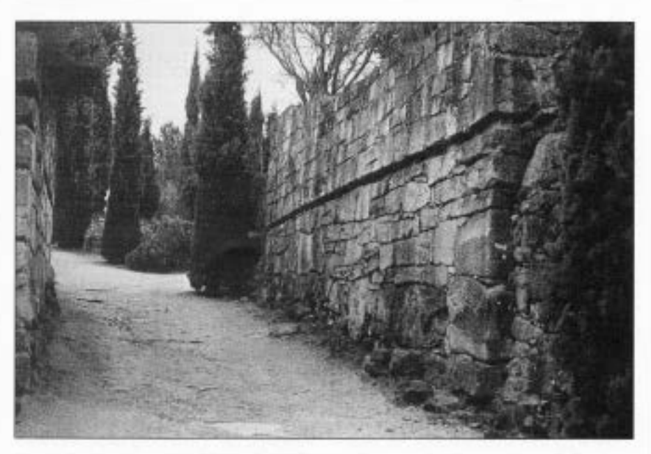
Figure 2 Remains of fortified walls and gate at the native Iberian oppidum of Ullastret, 600–200 bc (present-day Puig de S. Andreu, see Fig. 3).

One such period separates late antiquity from early medieval times. The invasions and movements of Germanic peoples in Iberia during the fifth century AD separated late Roman from early medieval Iberia politically. In AD 415, at the invitation of Rome, the Visigoths crossed eastern Tarraconensis in an attempt to bring the provinces back under Roman control. This was the first phase in the long and confusing process whereby Rome gradually lost all influence in Iberia. However, Tarraco, the capital of the province of Tarrconensis, remained in Roman hands until invaded by the Visigothic King Euric between AD 470 and 475, just before the dissolution of the Western Roman Empire. As a consequence, the distant and disputed Roman imperial power was replaced by a new