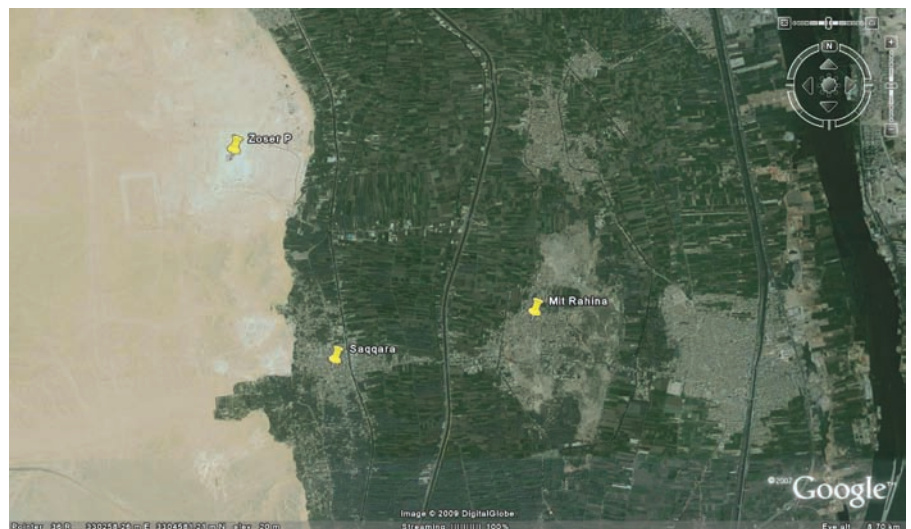
Figure 1 Satellite image showing the location of Saqqara and Mit Rahina, traditionally thought to be the location of Memphis.

five thousand years to the eastern side of the floodplain, and today flows close to the older rock and gravel strata of the eastern (Arabian) desert (Fig. 4). The dynamics behind this long-term shift are still not perfectly understood: there are probably multiple causes, such as aeolian sand deposition in the west from the Old Kingdom (2500 BCE) onwards, and the formation of alluvial sand and silt islands as part of the natural Nile regime, perhaps enhanced and augmented by human activity such as the construction of moles and earthworks to protect existing settlements from erosion.