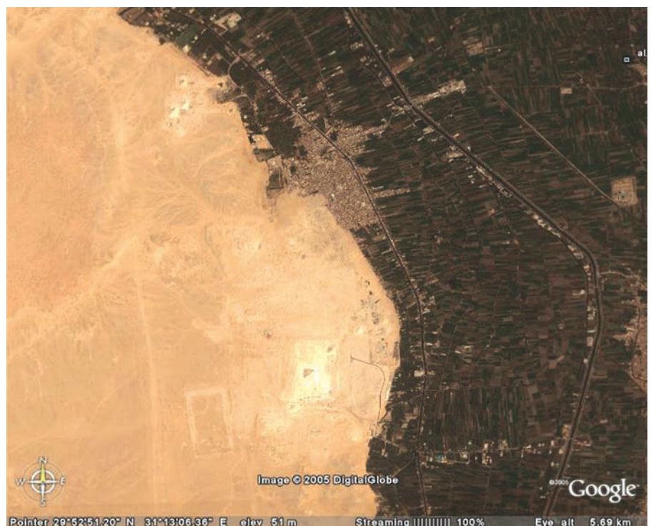
Figure 2 Satellite image of the Saqqara necropolis showing the Step Pyramid (centre) and the Abusir pyramids (centre top). Recent work has been concentrated in the valley E of the necropolis.