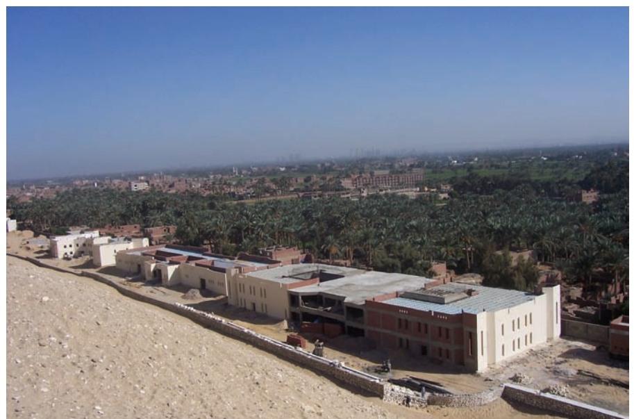
Figure 6 View looking north over the Nile Valley towards Cairo, showing new construction

At present we are particularly interested in the possibility that the later dynastic centre, around the town of Mit Rahina, was founded on a natural sand dune ( turtleback ). Here our sediment cores show archaeologically sterile coarse sand deposits at a fairly uniform depth of five metres below ground level (15 metres above sea level). If, as we suspect, the area around the modern town became the core of the city for the rest of its occupation history, then a natural sand formation presenting dry land above the floodplain and the reach of floodwaters could have been an irresistible target for settlement as