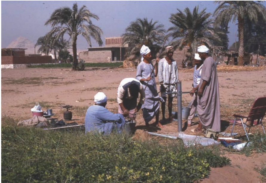
Figure 3 Sediment coring in the Nile Valley close to the Abusir pyramids (visible in background)

the Sixth Dynasty (c.2300 BCE), perhaps shifting in response to changing climatic conditions. Only at that time does the location of pyramid sites stabilize, and it is unlikely to be a coincidence that this happens closest to the eventual, later dynastic conurbation at Mit Rahina.