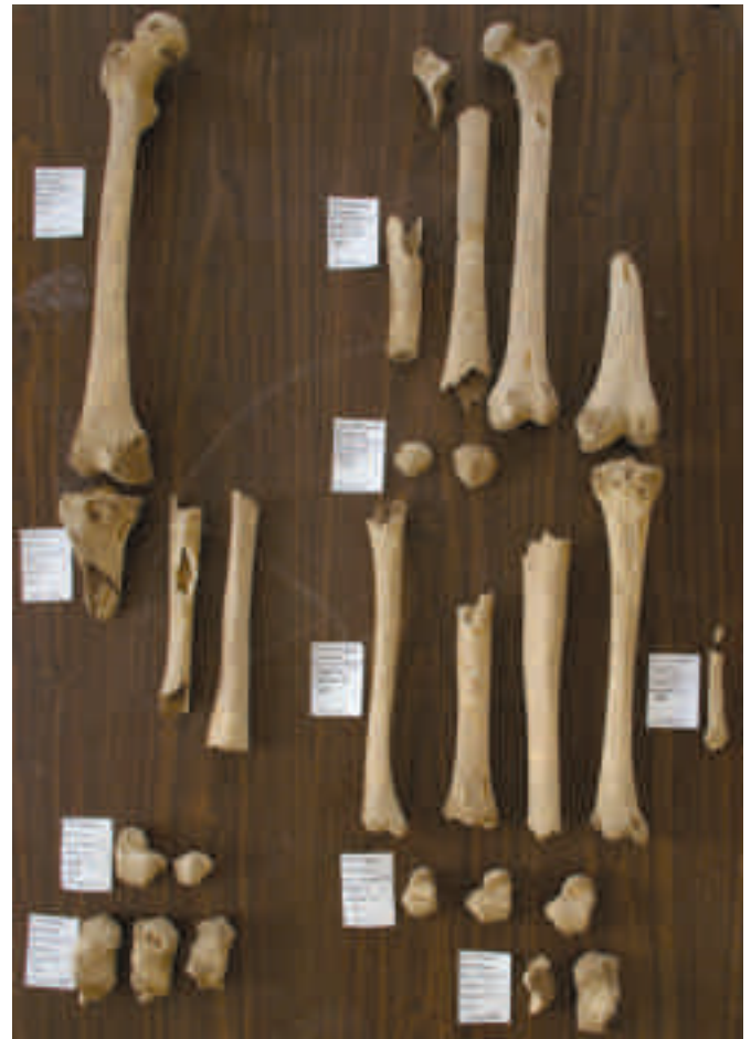
Figure 4 Lower limb bones from Grave 20, Katsalos cemetery representing at least three individuals

Most of the bone fragments retrieved from the graves could be attributed to the part of the skeleton to which they belonged. In addition, some fragments contained information about age at death and sex of the individuals buried within