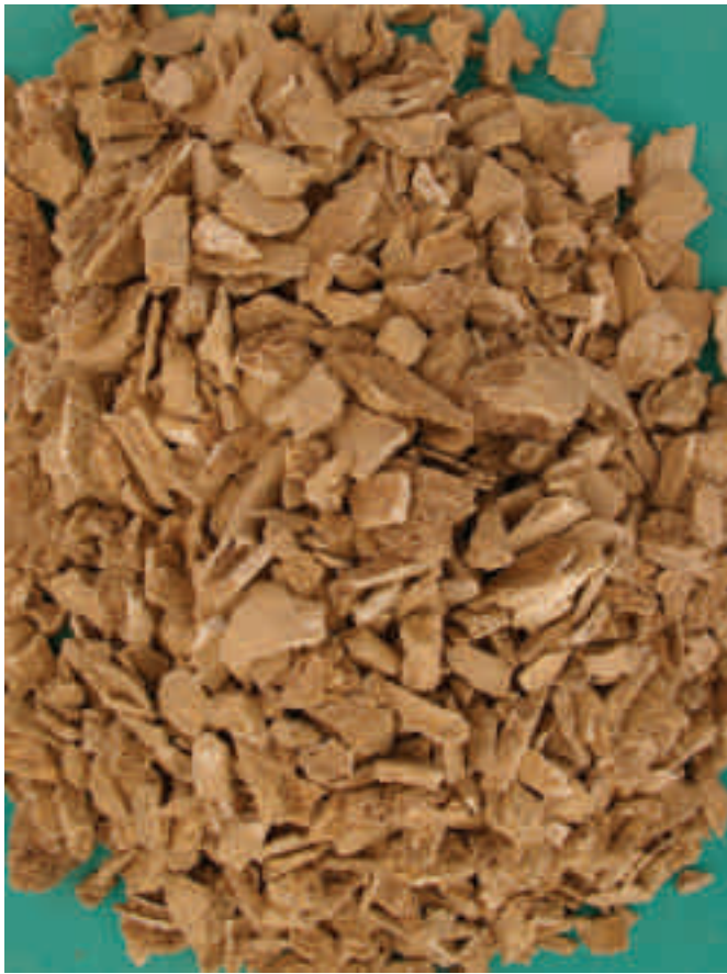
Figure 3 Bone fragments from Grave 3, Katsalos cemetery