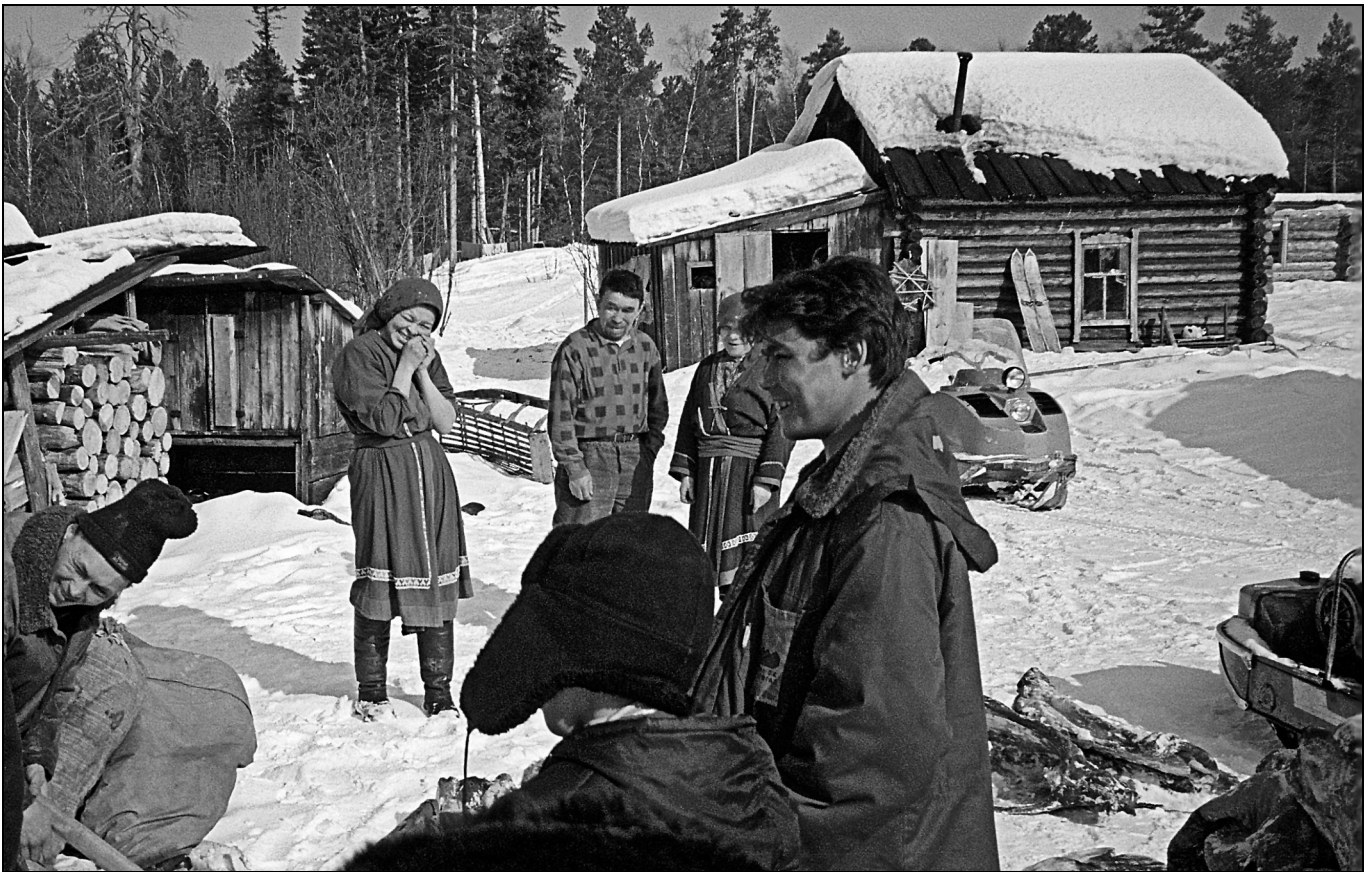
Figure 2 A riverside base camp or yurt, composed of the log cabins and storage huts of six Khanty households; the people are watching an elk being butchered by the man at the lower left, March 1999.

offspring, each a major deity, dwell in particular river basins. There each acts as a patron who protects the river's human community, and ensures health, welfare and hunting success. The first-generation offspring of these patron deities reside in a series of sacred local shrines (Fig. 3), each associated with a corresponding patrilineal settlement. In the deep taiga, other sacred places are associated with forest spirits, who must be left material offerings when humans re-enter particular tracts of the landscape, usually at the start of the hunting season. Hunting and trapping is explicitly regulated through patrilineal territoriality, and there are also exclusion zones around sacred sites and cemeteries; hunting on these lands of the sacred and the dead is an offence comparable with hunting on the land of another patrilineage. Holy sites and the rituals enacted at them are closely associated with particular lineages, so that the communities' responsibilities to the sacred places express, map and validate broader patterns of landscape ownership.