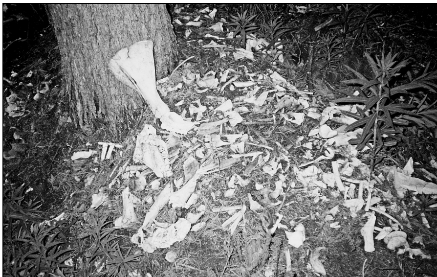
Figure 5 A cache or midden where bones of elk and wild deer have been deposited; traditionally, each household maintained one such midden in the forest at some distance from the yurt settlement.

archaeological sites tend to be regarded as domestic waste, evidence either of the subsistence economy or of feasting events; and yet, as the British archaeologist Richard Bradley has argued, "In neither case is it asked why they should be found at distinctive places in the landscape, and this is where a new study might begin". 7