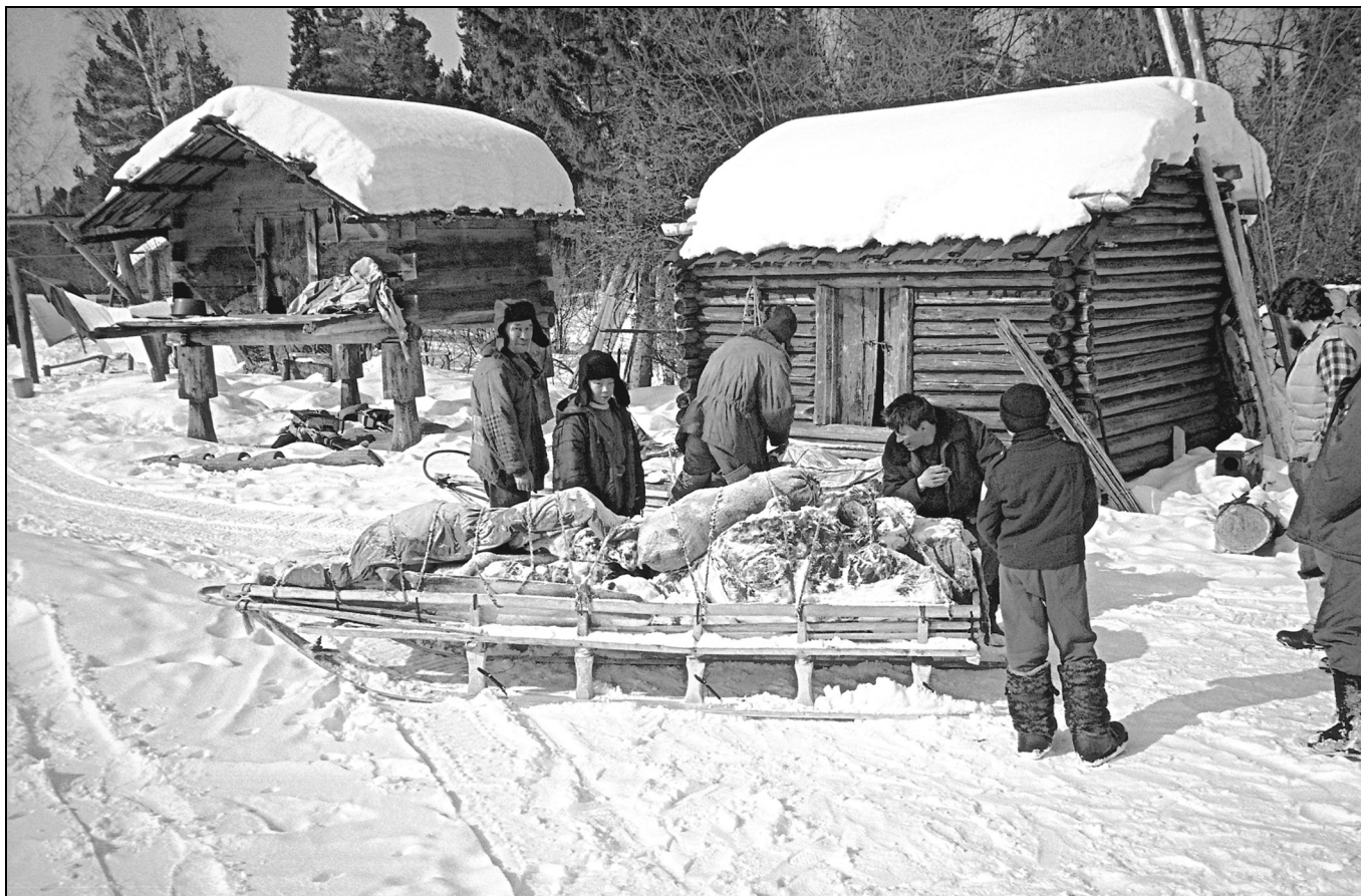
Figure 4 Hunters return to their yurt settlement with butchered elk carcasses on two cargo sledges, March 1999.

of communities, which articulates closely with the annual round of hunting, fishing and gathering, and the strong seasonality of the west Siberian environment.