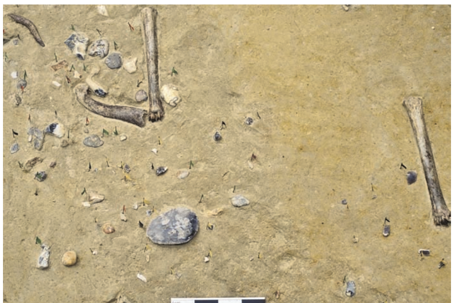
Figure 2 Lower limb bones of Cervus elaphus , a handaxe, flint flakes and beach pebbles, on the truncated surface of the marine sand at Boxgrove Q1/B