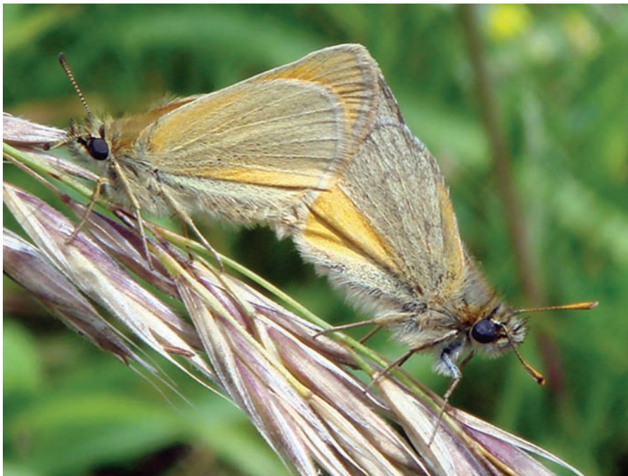
Figure 8 A pair of Small Skippers mating on the western hedgerow margin at Quarry 1

2009 work will begin on a census of the bumblebee and ant populations (Fig. 8). Along the western margin of the site, the field boundaries are left unmanaged and provide a mixed scrub, weed and nettle headland some 4m wide, which provides habitat for both insects and mammals. New species of animal recorded at Boxgrove this year include: muntjac deer, although their presence is not particularly desirable, ringed plover, purple sandpiper and merlin. The site has also been graced by the occasional visits from the Chichester Cathedral peregrine falcons.