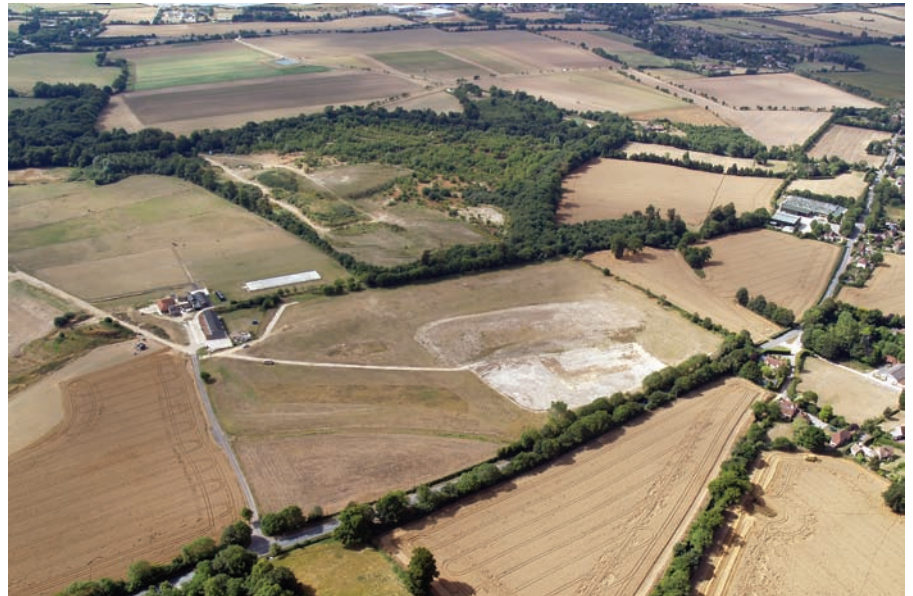
Figure 4 The restored Quarry 1 from the air, looking south. The footprint of the old trench at Q1/B can be seen in the expanded excavation area

in the late autumn; skylark patches are hand cut in the early spring. Most of the grass is allowed to seed before cutting, and weeds are now spot-sprayed, and in the specific case of ragwort, hand-pulled. The management policy has seen a dramatic return of flora and fauna to the site: on the more open banks flowers such as bee orchids are prolific (Fig. 6); elsewhere bluebells, lesser celandine, violets, common centaury, ox-eyed daisies, foxgloves and viper's bugloss are all re-established. On the chalk mound, wild thyme, clover and various vetches and the parasitical broomrape are all spreading across the thin calcareous cover. The establishment of the flora has encouraged an incremental growth in insect faunas (Fig. 7), and this of course has had a beneficial effect on the bird population, with last year seeing the first covey of grey partridges being hatched and raised in Quarry 1. At present only the butterflies and moths are being recorded but in