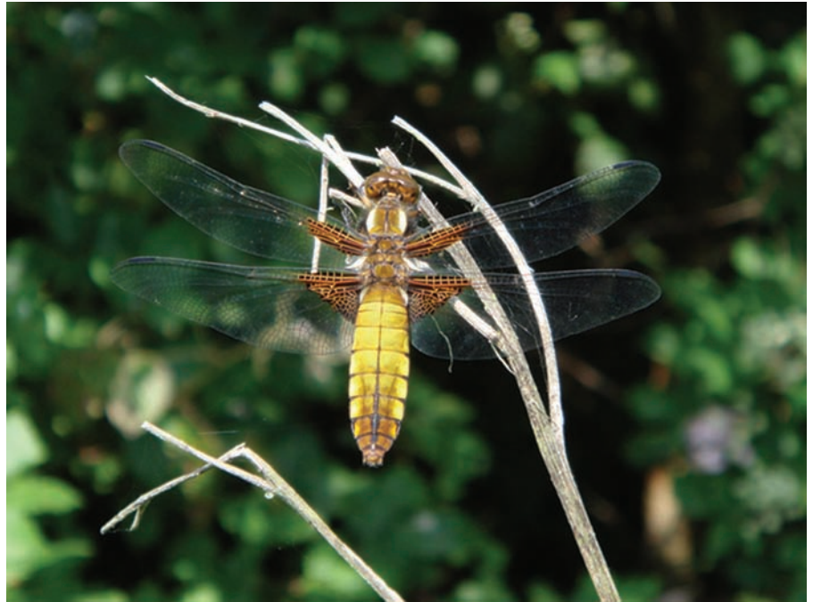
Figure 7 A Broad-bodied Chaser at rest on the Quarry 1 southern boundary