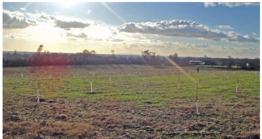
Figure 5 Tree planting in the top field at Boxgrove, looking southwest. The Isle of Wight is visible in the background