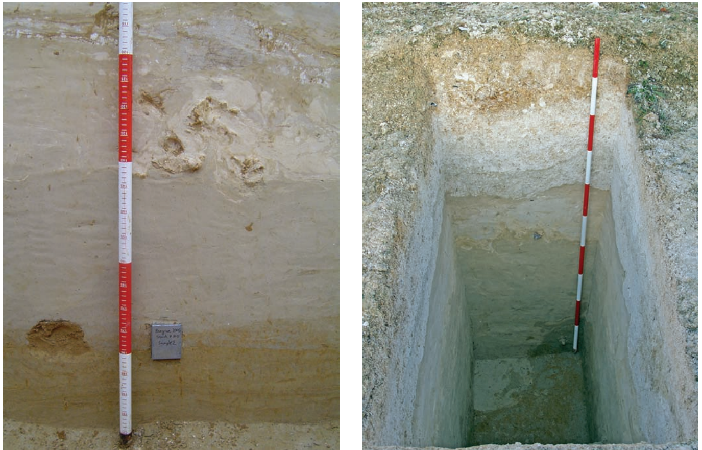
Figure 9 Recent test excavations at Q1B, left in the old main area and right at the northern margin of the new extension

the site has enabled the Devil's Ditch, a Romano-British entrenchment containing a medieval chalk road, to be brought into the restored quarry boundary, thus increasing the archaeological interest and diversity of the site.