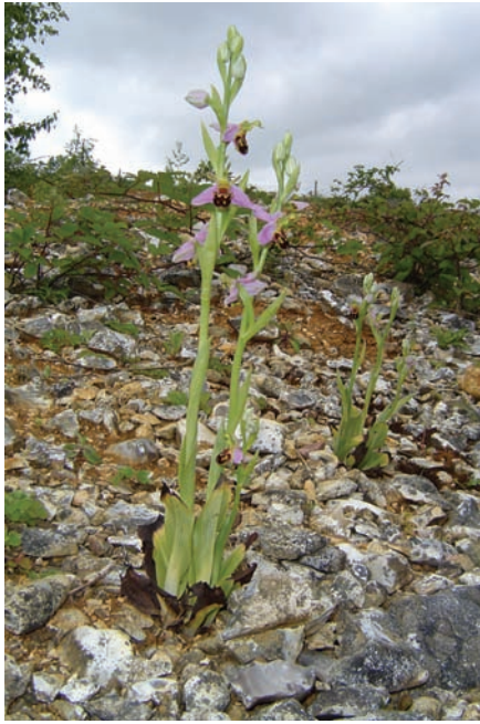
Figure 6 Bee orchids growing in the exposed gravel face in the northwest of Q1

2009 work will begin on a census of the bumblebee and ant populations (Fig. 8). Along the western margin of the site, the field boundaries are left unmanaged and provide a mixed scrub, weed and nettle headland some 4m wide, which provides habitat for both insects and mammals. New species of animal recorded at Boxgrove this year include: muntjac deer, although their presence is not particularly desirable, ringed plover, purple sandpiper and merlin. The site has also been graced by the occasional visits from the Chichester Cathedral peregrine falcons.