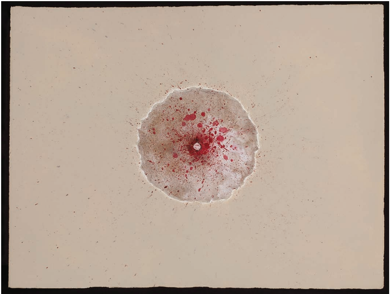
Figure 10 A Brian Graham painting inspired by an impact punctured horse scapula, from his recent work "The Book of Boxgrove"