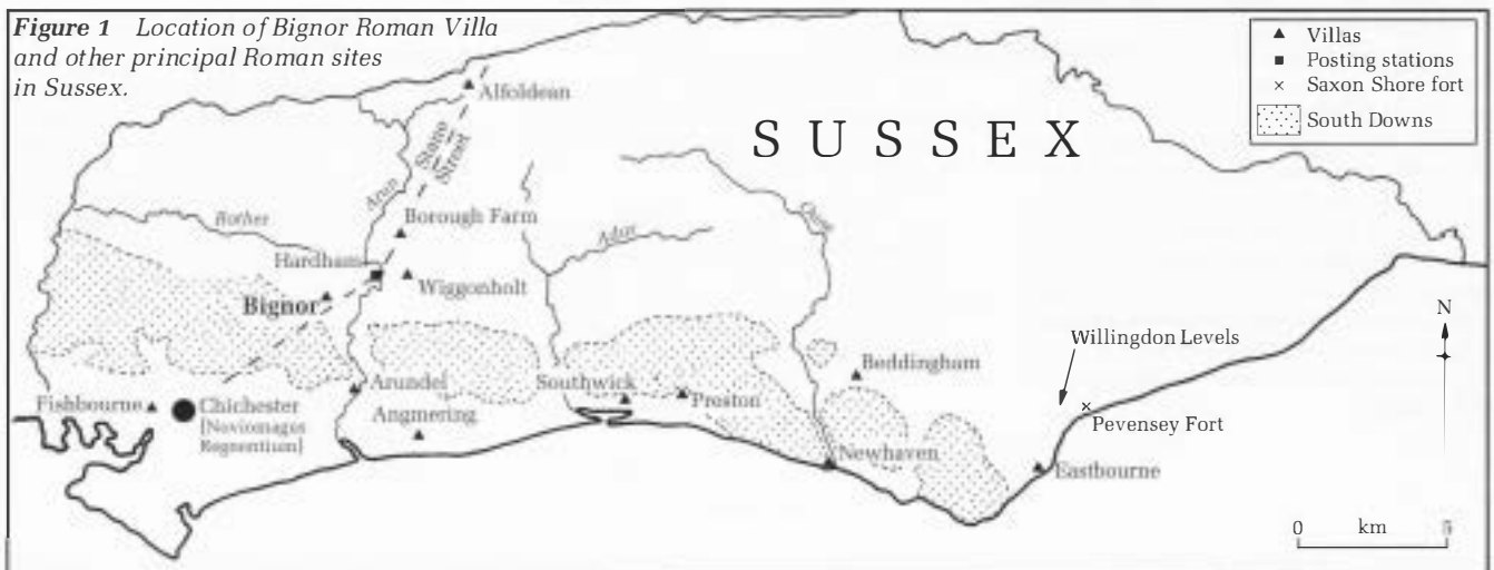
Figure 1 Location of Bignor Roman Villa and other principal Roman sites in Sussex.

The FAU's involvement with Bignor Villa goes back to 1985, when, in conjunction with West Sussex County Council, a programme of excavations was begun, designed to locate and assess the condition of parts of the villa that had previously been exposed during the early nineteenth century and subsequently reburied. As well as achieving these primary aims, excavations undertaken between 1985 and 1988 added considerably to our knowledge of the development of the site. In addition, as a direct result of these excavations the trustees of the villa removed from arable cultivation the entire area of the courtyard and its adjoining enclosure.