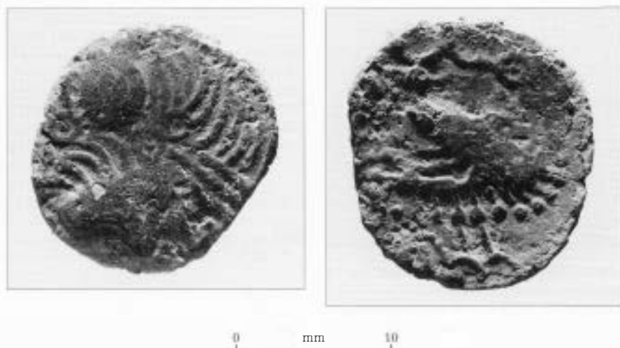
Figure 5 The Iron Age bronze coin of Chichester Cock type found at Bignor in 1997 (obverse: head facing right; reverse: cock holding snake in beak).

of Lysons' early-phase oblique walls (59), which was partially re-exposed during the excavations of 1991–93 (Fig. 4). This wall could be traced as far east as the eastern wall of the ambulatory, which overlies it, but unfortunately it was not possible to establish in which direction the wall turns. A ditch or trench on roughly the same alignment as the oblique wall, and previously revealed in Trench A in 1995, was located to the east of the ambulatory wall. The purpose of this linear feature is uncertain.