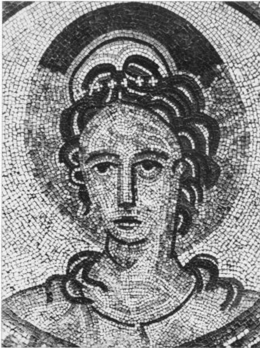
Figure 2 Part of the "Venus" mosaic at Bignor.

In 1990 the FAU returned to undertake various minor excavations, and in the same year the trustees moved the carpark from its old position inside the courtyard to a new site outside the enclosure wall to the south of the main baths. As a result, for the first time this century, there was an opportunity to examine the whole courtyard area archaeologically with the aim of increasing our knowledge of the history and development of the villa. Thus, at the invitation of the trustees, the FAU ran a programme of research and training excavations between 1991 and 1993 in order to investigate parts of the south corridor, the corridor connecting the north and south wings (porticus), the walkway (ambulatory), the southeastern area of the courtyard, and two early-phase oblique walls (Fig. 3: 59) recorded by Sam-