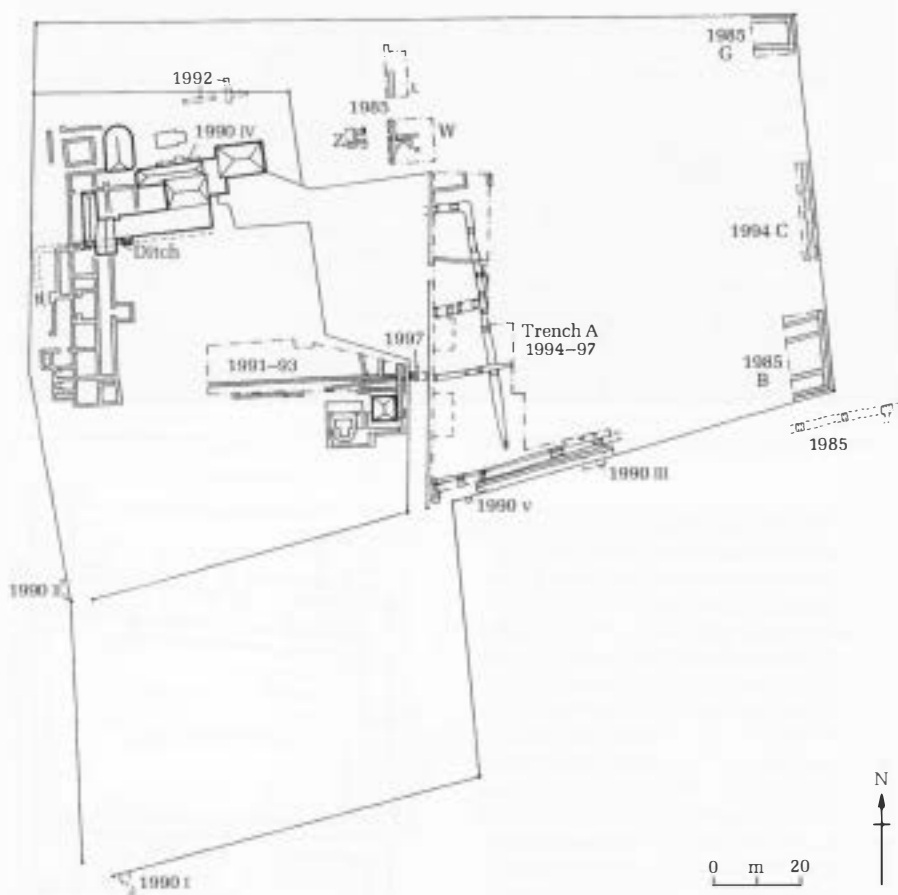
Figure 4 Bignor Roman Villa: plan of trenches excavated by the Field Archaeology Unit, 1985–97. Also shown are the modern cover buildings (bold) and surface markings of buried features.

A small trench excavated in 1997 to the northeast of the Medusa room was designed to investigate the eastern end of one