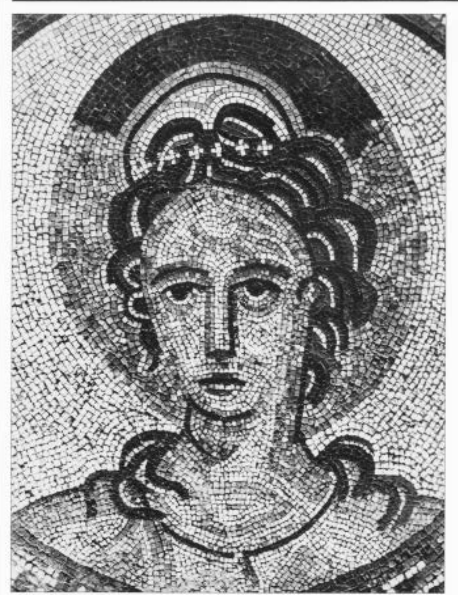
Figure 2 Part of the "Venus" mosaic at Bignor.

In 1990 the FAU returned to undertake various minor excavations, and in the same year the trustees moved the carpark from its old position inside the courtyard to a new site outside the enclosure wall to the south of the main baths. As a result, for the first time this century, there was an opportunity to examine the whole courtyard area archaeologically with the aim of increasing West our knowledge of the history and development of the villa. Thus, at the invitation of the trustees, the FAU ran a programme of research and training excavations between 1991 and 1993 in order to investigate parts of the south corridor, the corridor connecting the north and south wings (porticus), the walkway (ambulatory), the southeastern area of the courtyard, and two early-phase oblique walls (Fig. 3: 59) recorded by Sam-