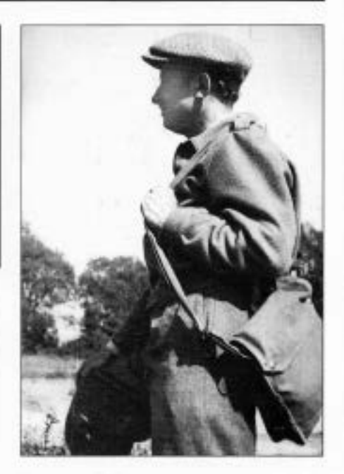
Figure 2 Frederick Zeuner leading a field excursion in the 1940s or 1950s; location unknown.

mainly as markers between glacial and archaeological deposits, and we struggled to find methods of dating geological strata and their archaeological content. Then, in 1951, came radiocarbon dating and life was never the same again.