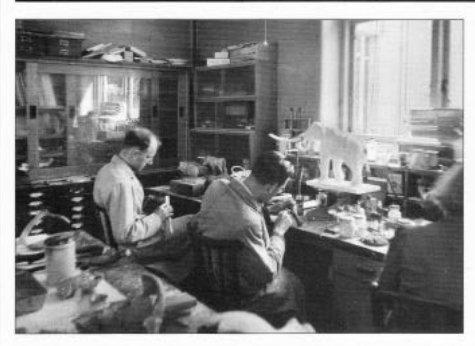
Figure 3 Part of the Institute's laboratory at St John's Lodge, Regent's Park, in the late 1940s or early 1950s, showing two students seated in front of two of the models: a straight-tusked elephant (centre) and a (smaller) aurochs (left).