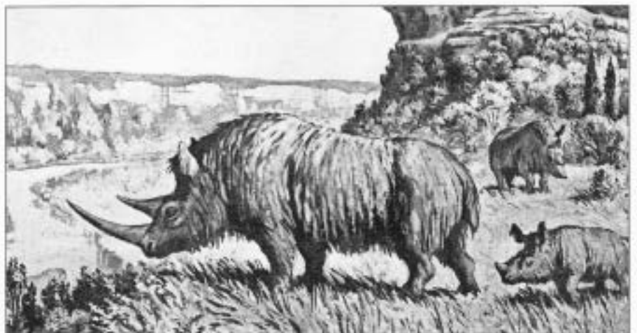
Figure 4 Diorama of woolly rhinoceroses on a ledge above the Vézère River in the Dordogne region of France during the most recent glaciation; painted in sepia and white by Marjorie Maitland Howard (reproduced from plate 25b in the 4th edition of Dating the past , 1958).

in its practical approach. One of my first tasks was to build up the collection of geological specimens so that the students could see the original materials from which stone artefacts were made. In August–September 1948 the International Geological Congress met in London and its members were invited to visit the Institute to see an exhibition mounted for the occasion. 5 We were able to put on a display of artefacts from such notable Palaeolithic sites as those discovered in the Olduvai Gorge in Kenya, as well as stone tools from India, and French Upper Palaeolithic material, including casts of bone and ivory tools. One of my other tasks was to make up displays of different soil profiles for classroom demonstrations, and we also arranged day trips for the field study of the