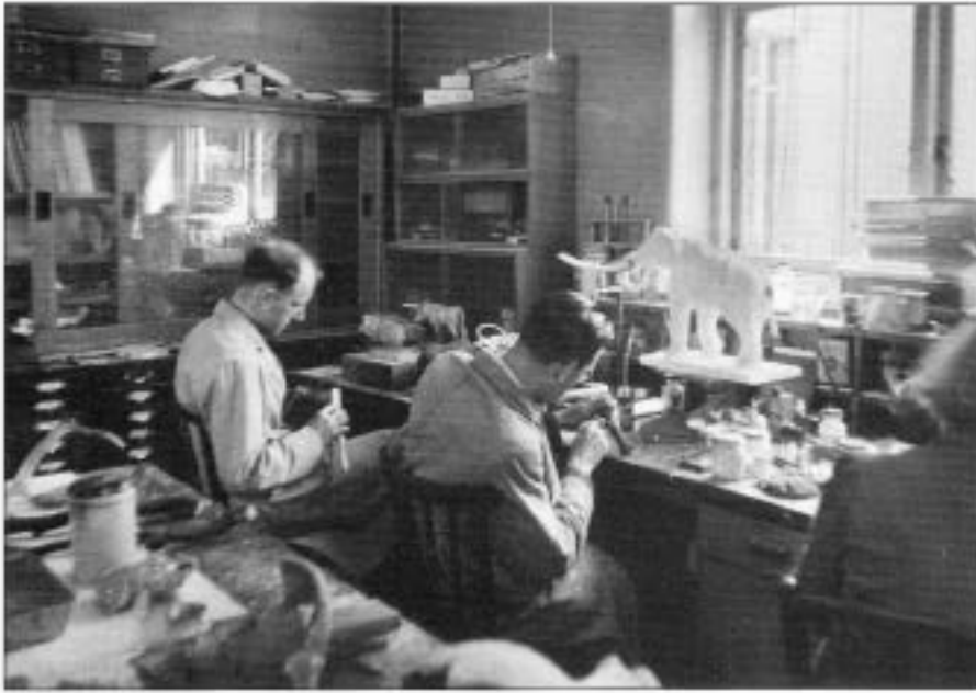
Figure 3 Part of the Institute's laboratory at St John's Lodge, Regent's Park, in the late 1940s or early 1950s, showing two students seated in front of two of the models: a straight-tusked elephant (centre) and a (smaller) aurochs (left).