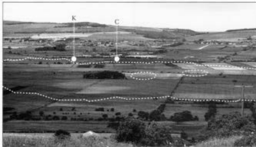
Figure 2 Part of the eastern Vale of Pickering: view north from the Yorkshire Wolds towards the North York Moors across the area of palaeolake Flixton (enclosed by dashed lines) and sites C and K at Seamer Carr; August 1977.

previously protected by the peat, are now closer to the surface and increasingly threatened by arable cultivation.