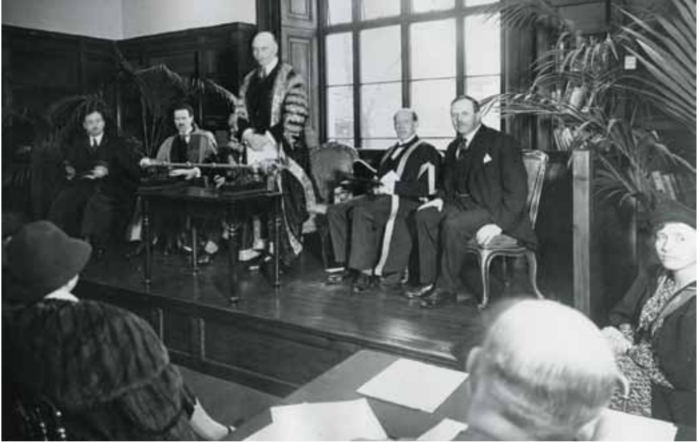
The opening ceremony of the Institute at St Johns Lodge on 29 April 1937, by the Earl of Athlone, Chancellor of the University of London. R.E.M. Wheeler is second to left, and Kathleen Kenyon is at the front in the foreground.