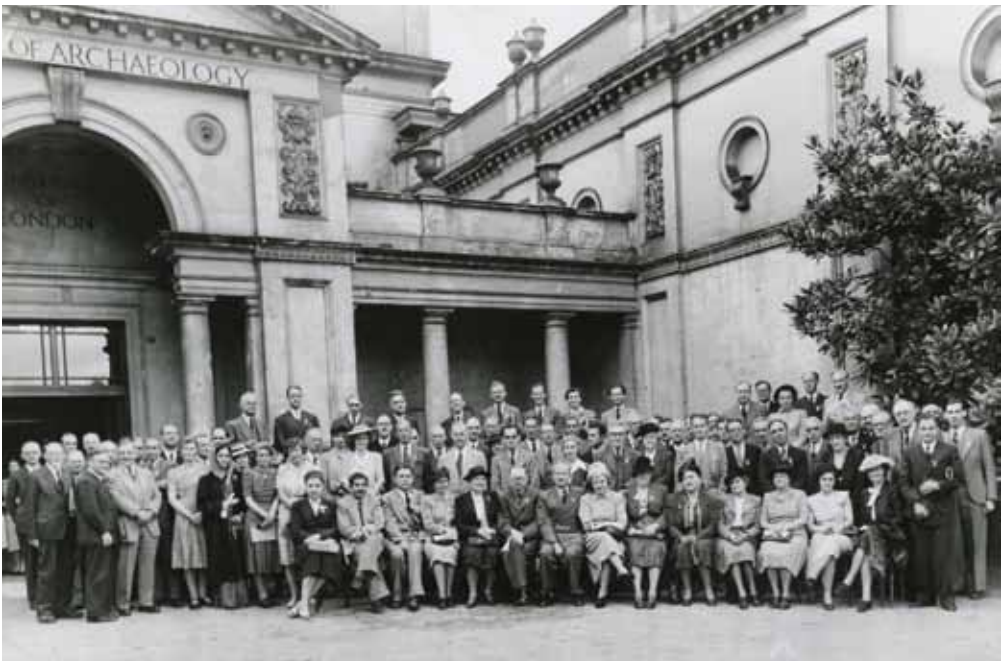
Staff and students at St John's Lodge, Regent's Park, in the 1950s.