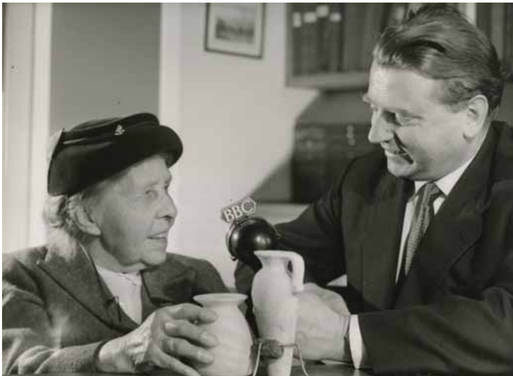
Margaret Murray (Assistant Professor of Egyptology) being interviewed by the BBC in c. 1960.