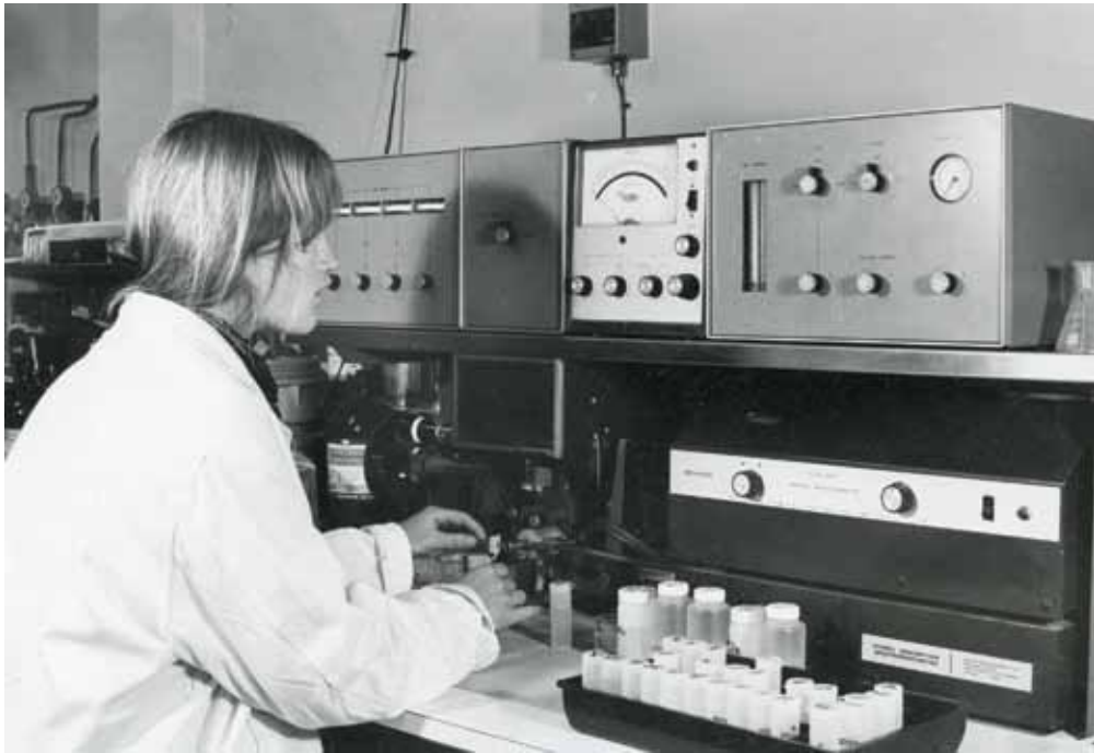
The Human Environment Department in 1960.