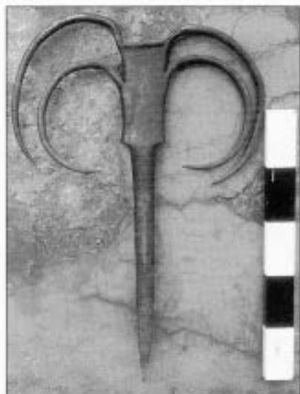
Figure 6 Ceremonial iron anvil with embossed horns from the Karagwe regalia (scale bar intervals 10 cm).

and in Burundi the king was regarded as a smith, a decidedly non-pastoral activity. Other elements in the Karagwe regalia include several smiths' anvils (often referred to as "hammer/anvils") and one exceptional item, an anvil with four crudely embossed horns, the design of which combines iron working and pastoralism in one object (Fig. 6). These regalia were all regularly incorporated into state ritual. Every month the king was required to perform the New Moon ceremonies surrounded by all his regalia, which ensured the successful re-emergence of the Moon and hence the fecundity of the kingdom's cattle and the fertility of its crops. Therefore, the king mediated between the conflicting interests of cattle and agriculture, and agriculture and its related activities were as important as pastoralism to the functioning of the state. Indeed, although in many areas pastoralists did dominate and subjugate agricultural populations, there were also large areas where independent agricultural populations existed, with their own chiefs and with their own small numbers of cattle.