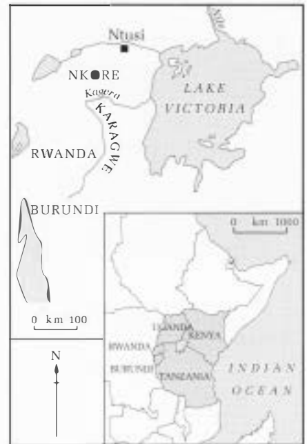
Figure 4 Pre-colonial kingdoms associated with cattle in the Great Lakes region.

simply move their herds to another state. The position of the king was therefore dependent on his ability to mediate the demands of his cattle owners. As a consequence, royal rituals featured heavily pastoral imagery, and the functions of the state and of the pastoral elite became increasingly intertwined. In Rwanda and Nkore the king was responsible for the organization of schools at the royal court where children of the pastoral elite were instructed in the ways of the state and subsequently formed regiments for the