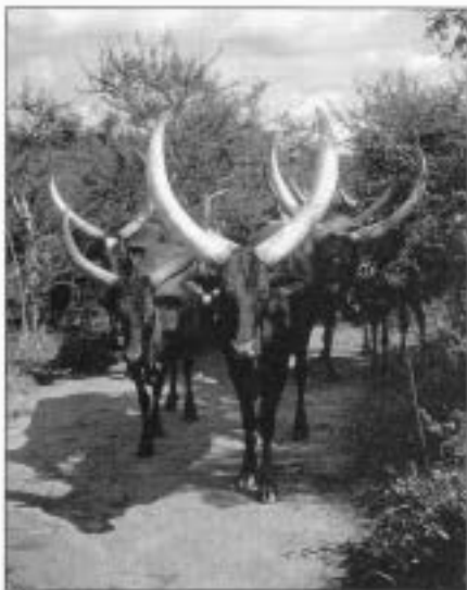
Figure 1 Long-horned Ankole cattle near Ntusi, southwestern Uganda.

The differences between Tusi and Hutu populations in Rwanda and Burundi are very similar to those between Hima and Iru populations in southwestern Uganda and northwestern Tanzania. One of the main differences that distinguish Tusi and