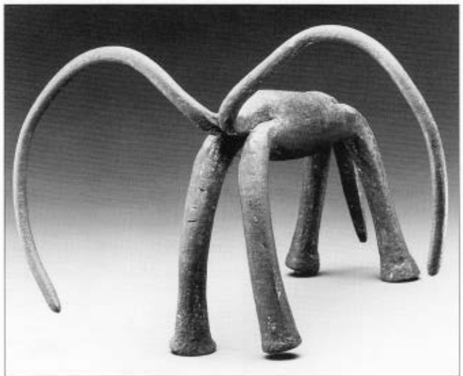
Figure 5 Iron cow (approximately 20cm high) from the royal regalia of the kingdom of Karagwe.

Perhaps the most significant single image that associated the state with cattle are the unique iron cows from the royal regalia of Karagwe (Fig. 5). They are part of a range of metal artefacts said to have been made in the early nineteenth century. 4 Their production and use indicate that the kings were not just super-pastoralists. The Karagwe regalia is generally agreed to have been made by Ndagara, the king who ruled in the early nineteenth century. In Karagwe