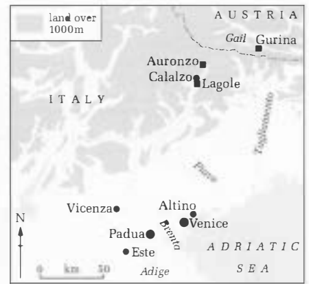
Figure 1 The region of the ancient Veneto, showing the location of the towns and archaeological sites mentioned in the text.

The use of written documents is a key point in the development of any society, but the impact that literacy had on the development of early Mediterranean societies is not well understood. The Ancient Literacy project at the Institute aims to examine the effects of literacy on early societies by studying the earliest written documents from three regions of pre-Roman Italy. In this article, a member of the project describes one of the case studies, in northeast Italy, where a large concentration of inscriptions and other objects dedicated to a deity have been found at a sacred lake.