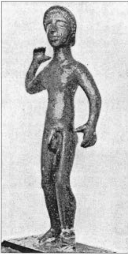
Figure 5 Bronze figurine of a warrior (15.5 cm high) from Lagole (fourth century BC). The inscription runs down the back of the raised arm, across the shoulder and down the side of the figure, and reads Broijokos donom doto Sainatei Trumusijatei ("Broijokos gave this gift to Sainatei Trumusiatos" or "Broijokos gave this gift to Sainatei Trumusiata").

other ritual sites in the valleys of the Gail and Piave (Fig. 1). This may indicate that Lagole was not unique but was part of a more general Alpine-Venetic culture with its own norms, in writing and votive offerings, as well as in other features.