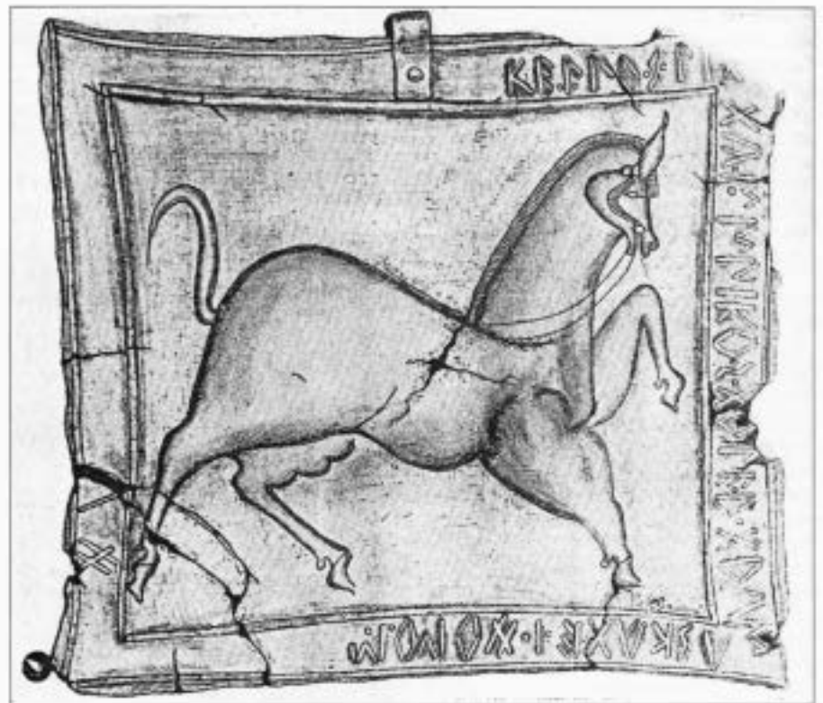
Figure 4 Bronze votive plaque (19×17 cm) from Lagole, with an embossed figure of a horse and an inscription around the edge reading Kellos Pittamnikos toler Trumusijatei donom d(onasto) a(isum) ("Kellos Pittamnikos gave this gift to Trumusiatos" or "Kellos Pittamnikos gave this gift to Trumusiata"); late fifth or early fourth century BC.

Although these may seem minor differences, they demonstrate that different communities in the region were developing their own distinctive cultures of writing and ritual. As well as differing from the religious sites of Este and Padua, the offerings and their inscriptions at Lagole are very similar to those found at