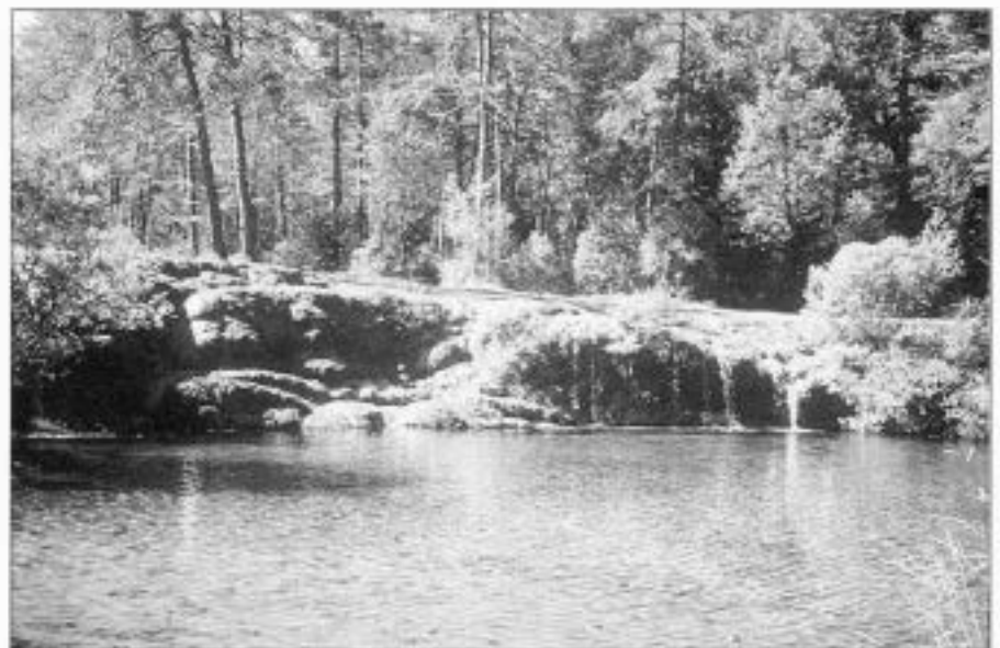
Figure 2 The site of the sanctuary at Lagole, showing the sacred lake.

The relationship in pre-Roman times between Lagole and the surrounding area is difficult to determine. It was close to the main Roman road of the area, the Via Claudia Augusta, which ran from the southern Veneto up into the Alps and which probably followed the same route as the major pre-Roman road. 8 There is evidence that the valley was under cultivation and well populated in both the pre-Roman and Roman periods, but local settlements were small and there was apparently no major settlement to which Lagole was attached – unlike the sanctuaries in the southern Veneto, each of which was part of the territory of a larger settlement. From 50 BC Lagole became part of the territory of the Roman colony of Julium Carnicum, but we