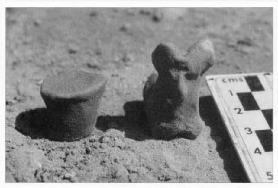
Figure 6 Animal figurine and "cone" (possibly used as a counter in a game) made of baked clay; excavated at Jeitun in 1993.