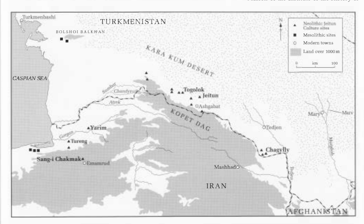
Figure 1 Southwestern Turkmenistan and northeastern Iran showing the location of mesolithic and neolithic (Jeitun Culture) sites; only those sites mentioned in the text are named.

It was at the small (0.7ha) tell site of Jeitun (Djeitun) on the edge of the desert, 25km north of Ashgabat, that the most comprehensive evidence for early agricultural settlement was found. There, Vadim Masson of the Institute of the History of