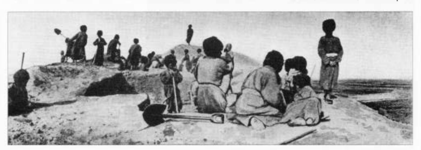
Figure 3 Contemporary photograph of Pumpelly's excavation beginning on the north kurgan at Anau in 1904 (see n. 4: p. 13).

Our investigations, from 1989 to our final season at Jeitun in 1994, have shown conclusively that domestic (6-row) barley and domestic (einkorn) wheat were cultivated, and domestic goats and sheep raised, at Jeitun when the site was first occupied at c.\,5000 bc (= c.\,6000 cal BC). The radiocarbon dates suggest that the settlement was occupied for perhaps no more than 500-600 years, not necessarily continuously; but its size, layout and architectural features, which broadly resemble those of early agricultural neolithic sites in Southwest Asia, indicate that, in the later phase