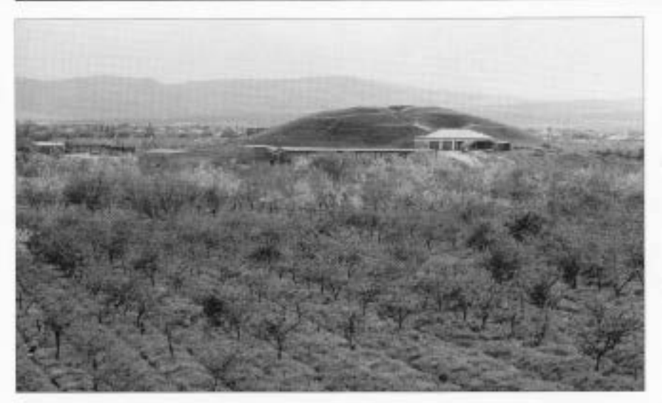
Figure 2 The south kurgan at Anau seen from the north kurgan, with the Kopet Dag range beyond.

Material Culture in Leningrad directed excavations that revealed the existence of a settlement consisting of small (20-30m<sup>2</sup>) rectangular houses built of mudbrick (Figs 4 and 5).5 The finds of pottery, bone and stone tools (particularly many sickle blades), together with impressions of barley and wheat grains in the mudbricks, indicated that the inhabitants cultivated cereals and herded sheep and goats. The presence of the bones of a variety of wild animals showed that the people also depended to some extent on hunting. No radiocarbon dates were obtained for Jeitun, but at two other sites on the piedmont - Togolok and Chagylly (Fig. 1) – levels judged on pottery styles to be somewhat later than Jeitun were dated, respectively, to 5370±100 bc and 5050 ± 110 bc.6