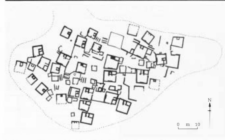
Figure 4 Plan of the early neolithic settlement of Jeitun (modified from V. M. Masson by J. Mellaart, n. 6: 213).

of occupation, it was a small village of some 30 houses and a probable population of between 150 and 200.