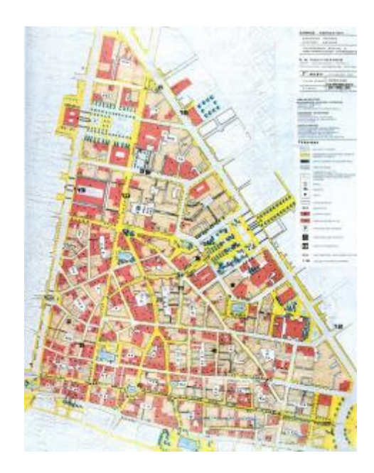
Fig. 3. Aravantinos et al, Master Plan for the Historical Centre of Athens, Urban Research Laboratory, School of Architecture, NTUA (1996): Proposal

The successful bid for the hosting of the 2004 Summer Olympics in 1997 was considered a rare opportunity for economic growth on the one hand, and the incorporation of Greek cities into the global cities' network on the other.[14] The recently adopted regulatory plan of 1985 did not however, foresee the accommodation of activities and land uses associated with such a mega-event. Consequently, the already debilitated and weakened plan was unable to meet the new goals. However, since time was a critical factor for meeting the criteria of the 2004 candidacy file, the necessary interventions were realised without updating the existent regulatory framework. Furthermore, no attempt was made to compile a new plan that would meet the new demands but rather, an emergency law was adopted in 1999 for the planning of the Olympic facilities.[15] Its major objective was the reduction of the time and paperwork required for the realisation of infrastructure projects. Although it was referred to as an 'update' of the regulatory plan, in essence, it was the quite opposite- it represented its abolition.