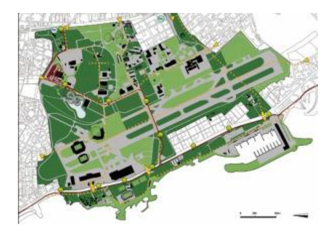
Fig 4. N. Belavilas et al, Master Plan of Ellinikon Former Airport Metropolitan Park of Athens, Urban Environment Laboratory, School of Architecture, NTUA (2010): Proposal