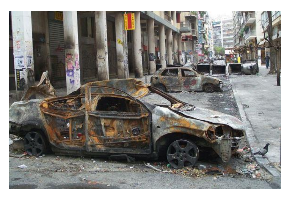
Badseed, Barricade at Stournari street during Athens riots, 2008.