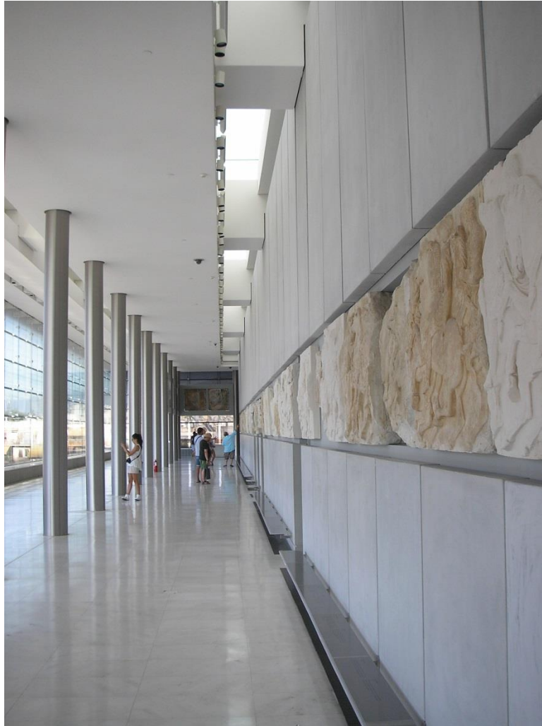
Figure 5. The frieze as displayed in the Parthenon Gallery of the New Acropolis Museum. Illuminated by natural light provided by the main windows and slit skylights above, the honey-coloured original marbles contrast sharply with the white plaster casts from those sculptures currently in the British Museum.

The natural illumination provided by the ‘sun-drenched top floor’ 67 of the New Acropolis Museum thus destroys the original light conditions in which the frieze was originally presented when on the ancient temple. Furthermore, the Parthenon Gallery also supplies additional illumination for these sculptures through means of overhead electrical spotlighting. 68 Provision of skylights and artificial lighting with which to better illuminate the frieze is no bad thing, and certainly provides visitors to the museum with a far more detailed view of the sculptural detail of the frieze than would ever have been possible for the ancient Athenians. However, they seriously undermine the claim that the New Acropolis Museum closely replicates the light conditions that the frieze experienced when originally attached to the Parthenon. The original architectural context of the frieze, and the intensity of the illumination with which the sculptures would have been visible to fifth century BC Athenians, has thus been firmly denied by Bernard