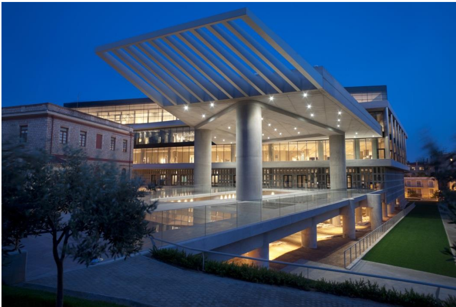
Figure 1. The north-facing forecourt and entrance of the New Acropolis Museum at night. Photograph: Nikos Danielidis. © Acropolis Museum.

bright natural light. The ability to display the Marbles in the sun-drenched gallery of the New Acropolis Museum forges a powerful emotive link that binds the environment of Classical Athens with that of the present-day capital of Greece, offering politicians and activists seeking the repatriation of the Elgin Marbles a potent weapon that has been wielded to great effect. However, the politically motivated design parameters laid on the New Acropolis Museum, with one of the primary requirements dictating that the building admit natural vast amounts of natural Attic light into the galleries, has destroyed the architectural context within which many of the Marbles were displayed when originally affixed to the temple in the fifth century BC.