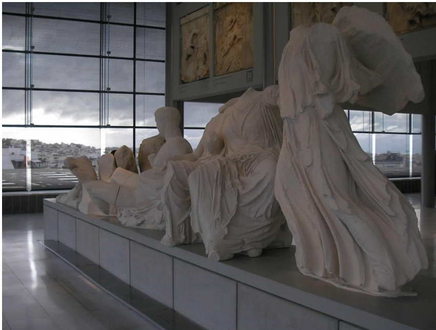
Figure 6. The casts of the pediment statues from the southern end of the east side of the Parthenon, with the original Pentelic marble metopes behind. Note that, despite the overcast skies of early December, there are blinds on the windows. The sculptures are clearly denied unimpeded access to the natural daylight; contrast the brightness of the single narrow ray of daylight penetrating through a gap in the blinds and across the floor of the Parthenon Gallery compared to the more muted light that has to pass through the black mesh of the blinds. The Marbles on display along the southern side of the New Acropolis Museum (facing out over the modern cityscape rather than towards the ancient monuments on the Acropolis) are instead viewed in considerably more shaded conditions than would be the case were they in their original positions on the exterior of the Parthenon.

‘The management of the gaze is the primary concern of its archaeological and museographic apparatus. Glass architecture enables visual contact with the monument [i.e. the Parthenon] and lets light in, but it can have another advantage: it makes the control of viewsheds from the vantage point of the museum possible, and the vistas experienced by the visitors, changeable (hence the drapes and blinds Plantzos refers to, which hide ‘ugly’ modern blocks, and direct the gaze towards the Acropolis).’ 72