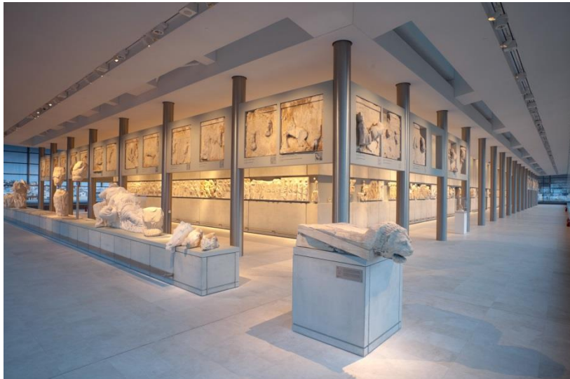
Figure 3. The north-east corner of the Parthenon Gallery in the New Acropolis Museum. The sculptures from the east pediment of the temple are to the left, while the metopes are displayed on tubular steel supports, with the frieze visible behind. Such a presentation partially replicates the original arrangement of the marbles on the Parthenon, although the sculptures of the pediment are positioned below, rather than above, the other two sets of marbles.