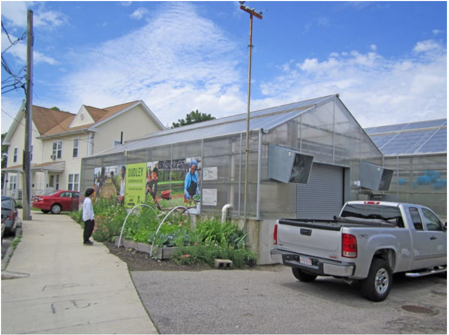
Figure 3. Growing your own activists, Dudley Street

This is confirmed by a meeting with a local councillor in Dunkin Donuts in nearby Blue Hill Avenue, part of the symbolic boundary of the Dudley Triangle, where the message is one of value creation by DSNI and how their intervention has led to neighborhood stabilization and, not least according to the politician, has provided a foundation that has overcome disenfranchisement and exclusion. 35