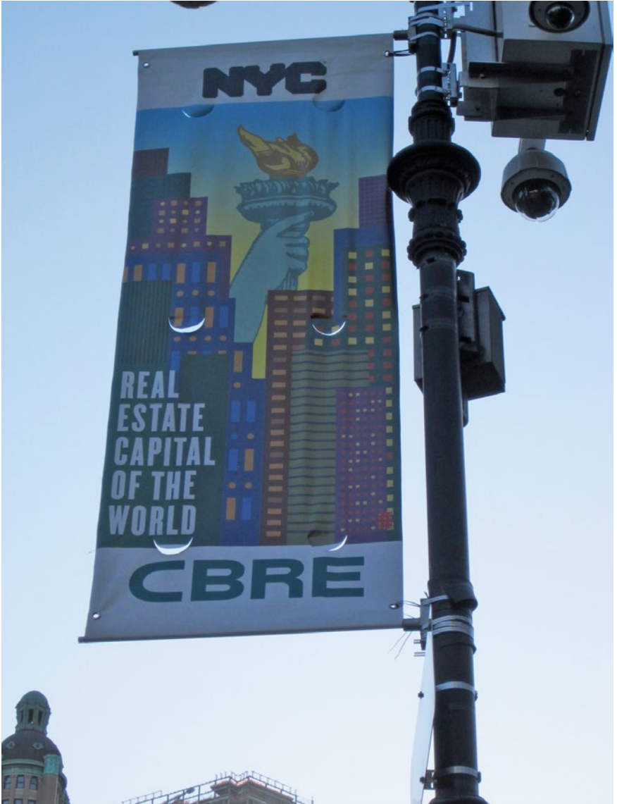
Figure 1. Cooper Square and the ‘Real Estate Capital of the World

One of the organizers explained that, even with a long tale of immigrant workers arriving into the neighbourhood, it has never fitted the sociological model of a “melting pot” and is a place where communities, and people in those communities, pursue their religion and politics as they remain relevant to their culture. The Cooper Square Committee was formed in 1959,