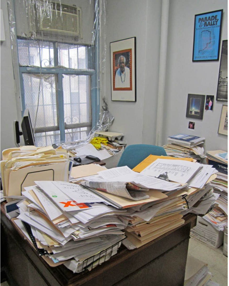
Figure 5. The cluttered desk of an activist or overworked professional?

We find a language of advocacy which is more than a professional buy-in to the principles of the CLT and of the activism behind it: