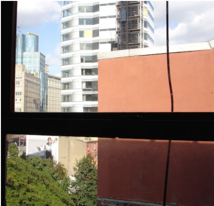
Figure 2. The Cooper Square neighbourhood under gentrification pressures: view from inside a CLT apartment

In Cooper Square, the timing could not have been less fortuitous. Robert Moses' plan was only defeated after a prolonged battle that lasted from 1959 to 1971. In 1971, "we got the green light from the city that they would accept our plan which was 'The Alternate Plan.' So, when they gave us the green