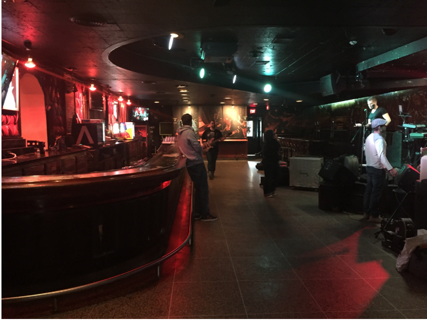
Figure 5. Interior of the Silver Dollar Room viewed from the entrance side of the space. The bar area is to the left, and the stage is to the right. In this photo a band is setting up its performance space for later that night.

status designation of the Silver Dollar Room led to encouraging results for its future and the preservation of its intangible cultural heritage and high generated use-value. 77 The new development will involve the heritage restoration and maintenance of the current space of the Silver Dollar Room as well as its iconic sign, and will also be constructed in a manner that emphasizes the built form of the Silver Dollar. 78 In particular, conservation measures