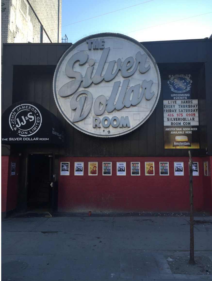
Figure 3. Exterior of the Silver Dollar Room, with its iconic sign.

The Silver Dollar Room is located on the west side of Spadina Avenue, just north of College Street, in Toronto, Ontario, attached to the side of the