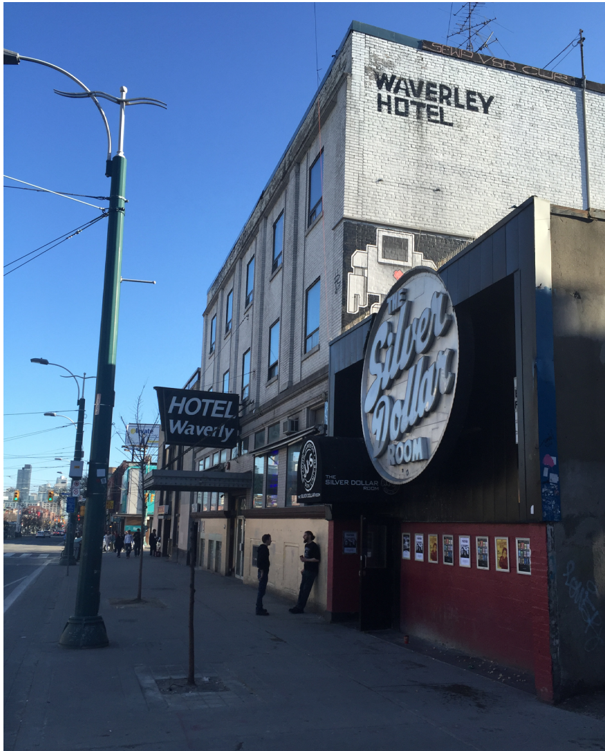
Figure 1. The Silver Dollar Room block, where the venue is located beside the Hotel Waverly.

On January 13, 2015, one of Toronto, Canada's, iconic live music venues, the Silver Dollar Room, officially received cultural heritage designation pursuant to the City of Toronto By-law 57-2015 under Part IV, Section 29 of the Ontario Heritage Act (OHA). 5