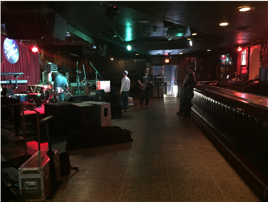
Figure 2. Interior of the Silver Dollar Room, viewed from the rear of the venue. The bar is on the right side and the stage is on the left. The center part is generally where the audience stands during live music performances. In this photo, a band is setting up their performance space for later that night.

Protecting Toronto's live music venues, such as the Silver Dollar Room, from redevelopment projects and the gentrification of spaces is integral to the flourishing of Toronto's live music culture and nighttime arts scene in the city, and for the sustenance of this intangible element of Toronto's modern cultural heritage. Where legal frameworks govern the everyday experience of culture in the city through provincial and municipal zoning and planning decisions by bodies like the Ontario Municipal Board (OMB) and Toronto City Council, it is important to study how they manifest, or, as Valverde describes, "the microdetails of the governance process, rather than ... the big-picture outcomes." 26