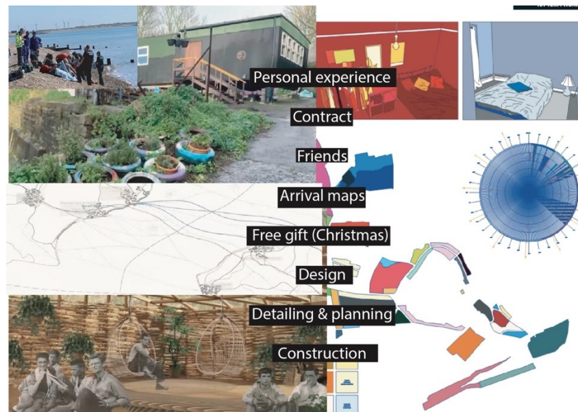
Figure 2. Global Free Unit project phases (Source: photo composition by Peter Hemmersam; mapping and design illustrations by Bogdan Rusu and Camilla Thurn-Valsassina)