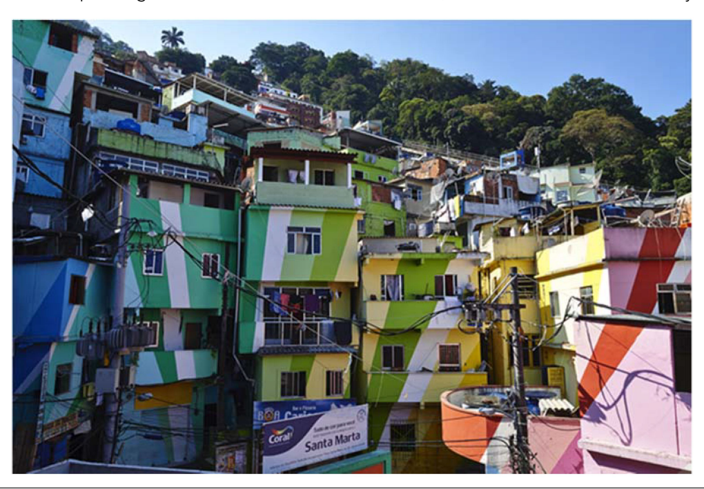
Figure 1. Favela painting, Santa Marta, Rio de Janeiro, Brazil (Source: Andrea Pistolesi/Getty Images).