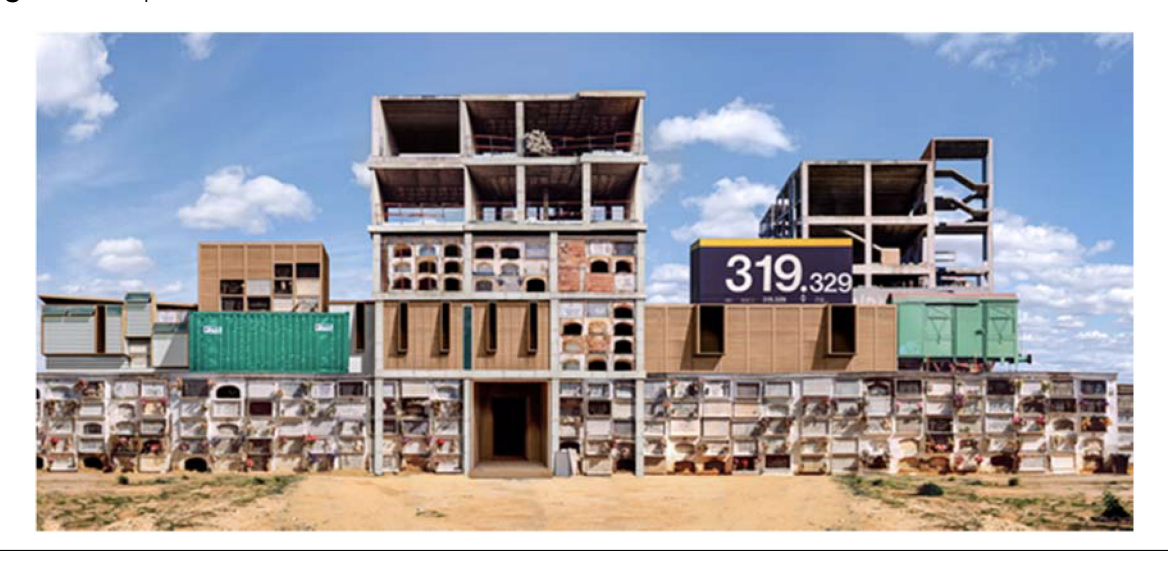
Figure 3. Exquisite Cadavers, São Paulo, Brazil.

The exhibition consists of a bricolage of images and memories that originate from the artist's own life experiences. Kader Attia, a French national with Algerian family ties, grew up in the banlieues of Paris , in a north African immigrant community on the urban periphery, a site of poverty and discrimination. After studying art in Paris and Barcelona, Attia spent three years in the slums of Brazzaville and Kinshasa (Democratic Republic of Congo), an ethnographic practice that undoubtedly inspired his artistic visions and representational choices. Although the installation assembles translocal images of dispossession, Attia visualises his work in terms of a Kasbah , a North African medina or Islamic city. By using this architectural trope, the artist interprets slums as fortified, defensive constructs. In the exhibition, the primary signifiers of this motif enter the visual field as an expansive urban landscape of metal rooftops, variously arranged across a horizontal ground. The idea of a shanty community as a protective enclosure is implied, simulated by an artistic construct that invites visitors to look at and walk across the installation to re-enact the tactics of power – visually and physically (see Figure 4).