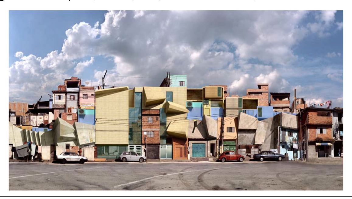
Figure 2. Nova Heliópolis II, São Paulo, Brazil (Source: Dionisio González).

The artist's favela images are seemingly lifeless: the ground (streets, sidewalks) is swept clean; cars, tyre tracks, windows, illusive entryways and sometimes laundry hanging from a clothesline are the sole indexes and reference points for human presence. By focusing his attention on 'these massive, unregulated settlements', González not only attempts 'a partial intervention of these "chaotic spaces"' but 'proposes a radical restructuring' of shanty-town architecture by 'improving the precarious conditions of habitability'.<sup>52</sup> Although these representational works acknowledge the agency of the city-building inhabitants, the product of their labour is perceived as deficient, requiring intervention. Techniques of estrangement have become an artistic tool for the visual erasure of poverty, as if seeing and looking at shanty towns must be facilitated by the transformation of social and architectural realities for a global consumer public. The manufactured images not only impose a modernist logic but also present sanitised visual realities – emptied of people and social worlds. Through these tactics of estrangement, shanty architecture is no longer envisioned as 'home', 'house' or 'dwelling' inhabited by actual people.