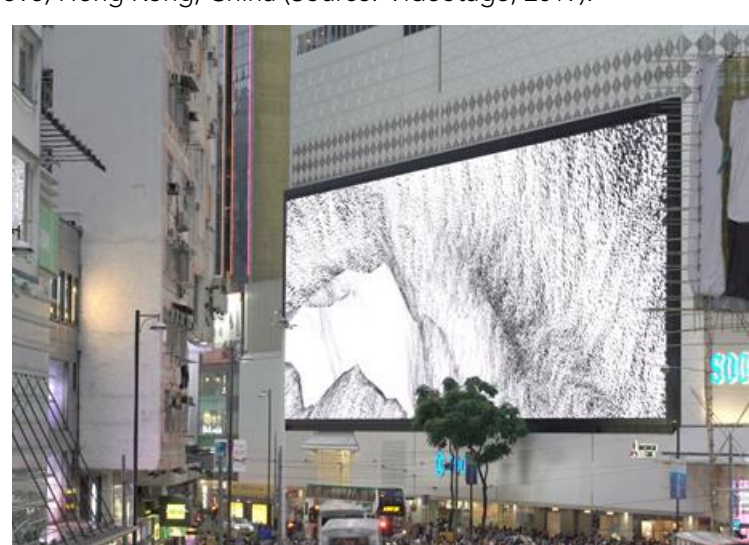
Figure 2 Black Move, Hong Kong, China (Source: Videotage, 2019).

On some occasions when Chan visited Causeway Bay during the month-long project, she observed many pedestrians caught by her work, not because of visual bombardment, but a sense of tranquillity. For many Hong Kong people, her work provides an alternative to the desensitisation of advertisements on public screens. Black Move is like therapy for pedestrians, to restore a sense of wholeness under the backdrop of the highly commoditised lifestyle, as if there is a way to feel tranquillity in disorder. Black Move helps construct a different atmosphere in Causeway Bay, directing an alternative form of imagination for those who participate in city life.