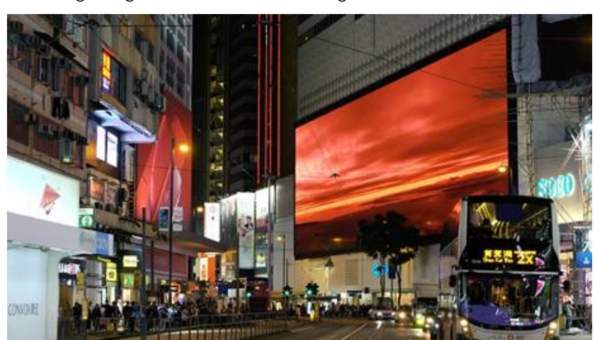
Figure 1 Embers, Hong Kong, China (Source: Videotage, 2019).

Indeed, pedestrians' sensory perceptions of Zheng's work were not directed towards discrete objects, colours or shapes but arose from 'a sense of atmosphere'. 24 Considering the divided attention of pedestrians crossing the busy street and many factors affecting their actions, the viewing experience in such a context is always partial, encapsulated in the dynamic activities that take place at the site. While images morphed into the building's surface during the exhibition, they were being transformed into something else – an aesthetic meaning mediated by fragments of the artist's projected reality and illusion.