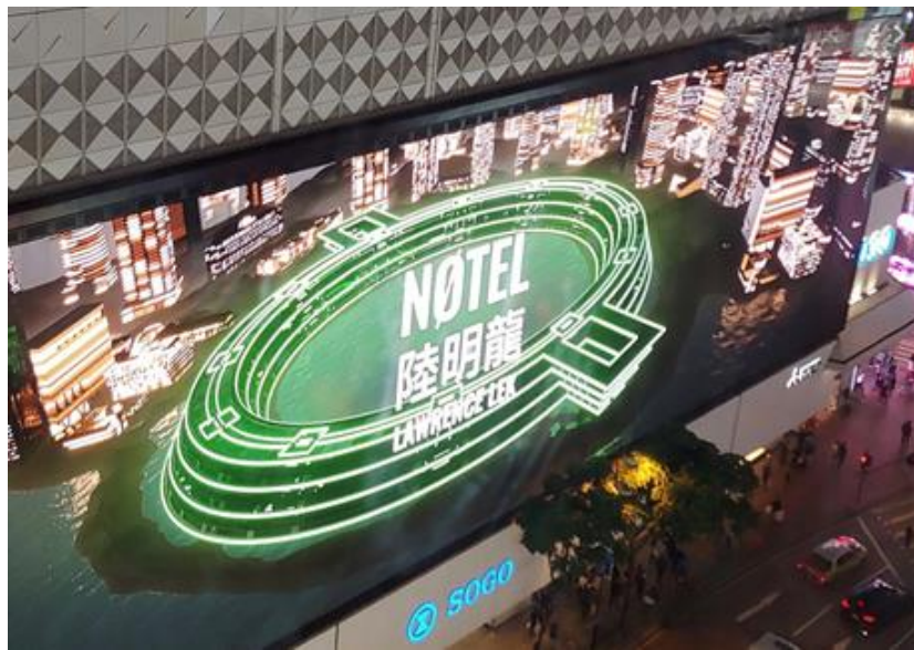
Figure 3 Nøtel, Hong Kong, China.