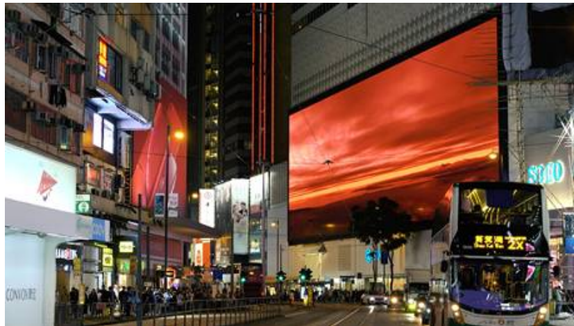
Figure 1 Embers , Hong Kong, China (Source: Videotage, 2019).

Indeed, pedestrians' sensory perceptions of Zheng's work were not directed towards discrete objects, colours or shapes but arose from 'a sense of atmosphere'. 24 Considering the divided attention of pedestrians crossing the busy street and many factors affecting their actions, the viewing experience in such a context is always partial, encapsulated in the dynamic activities that take place at the site. While images morphed into the building's surface during the exhibition, they were being transformed into something else – an aesthetic meaning mediated by fragments of the artist's projected reality and illusion.