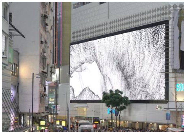
Figure 2 Black Move , Hong Kong, China.

On some occasions when Chan visited Causeway Bay during the month-long project, she observed many pedestrians caught by her work, not because of visual bombardment, but a sense of tranquillity. For many Hong Kong people, her work provides an alternative to the desensitisation of advertisements on public screens. Black Move is like therapy for pedestrians, to restore a sense of wholeness under the backdrop of the highly commoditised lifestyle, as if there is a way to feel tranquillity in disorder. Black Move helps construct a different atmosphere in Causeway Bay, directing an alternative form of imagination for those who participate in city life.